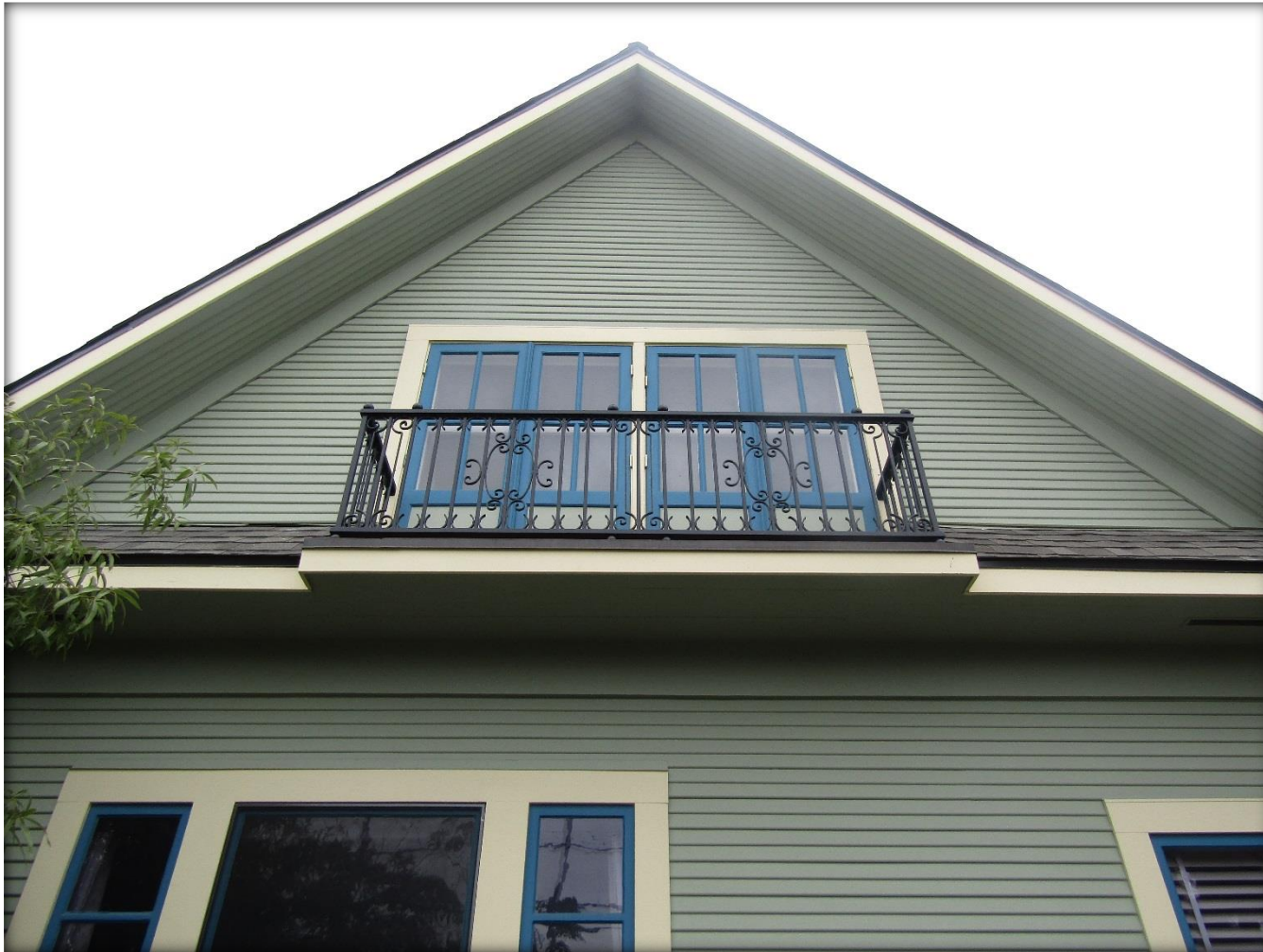
French Door and Balcony Detail, Street Façade