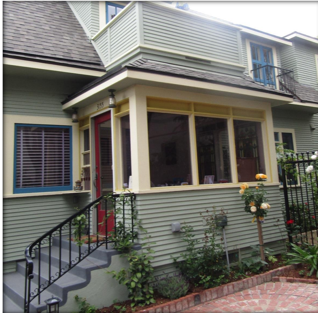
Enclosed Porch Detail