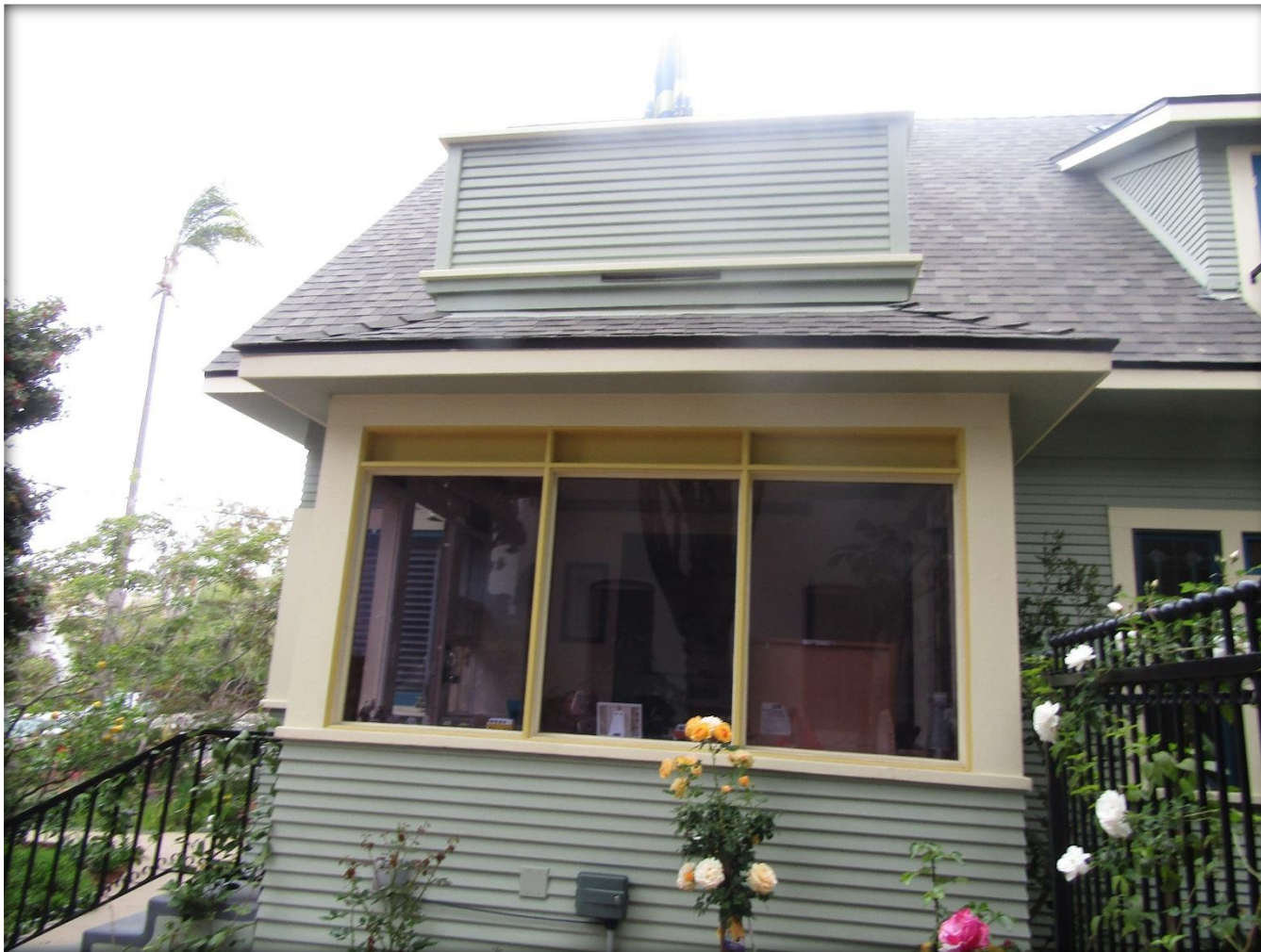
Enclosed Porch, South Façade