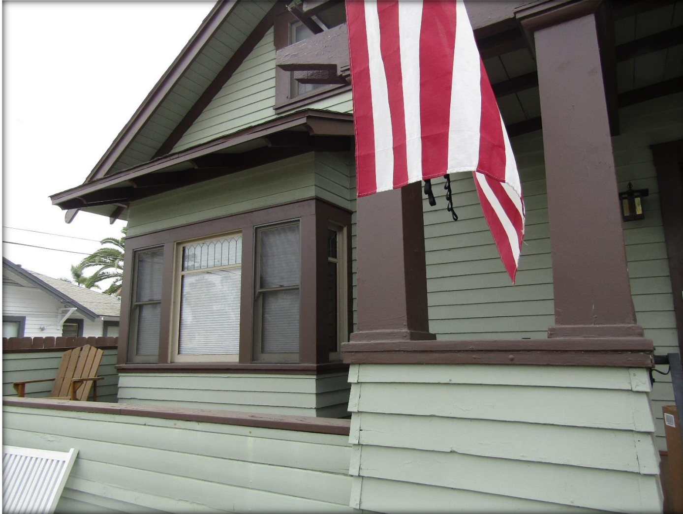
Window /Porch Detail