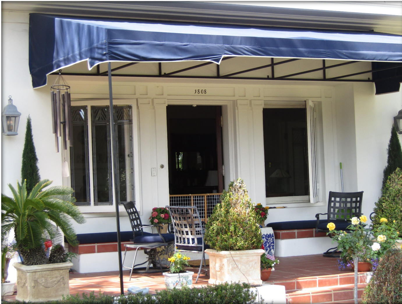
Front Entry Detail