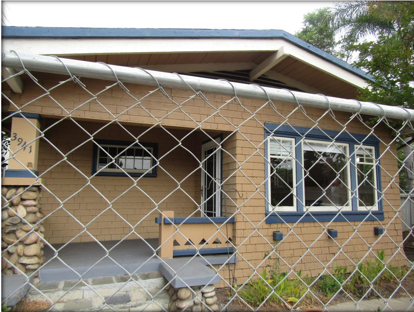
Front Entry Detail