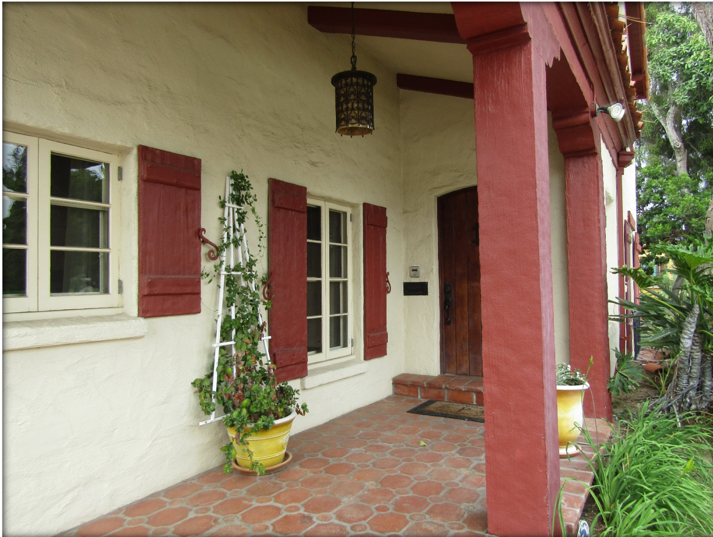
Entry Porch and Front Door