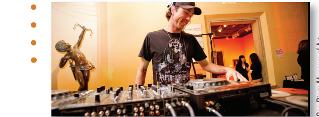
San Diego Museum of Art