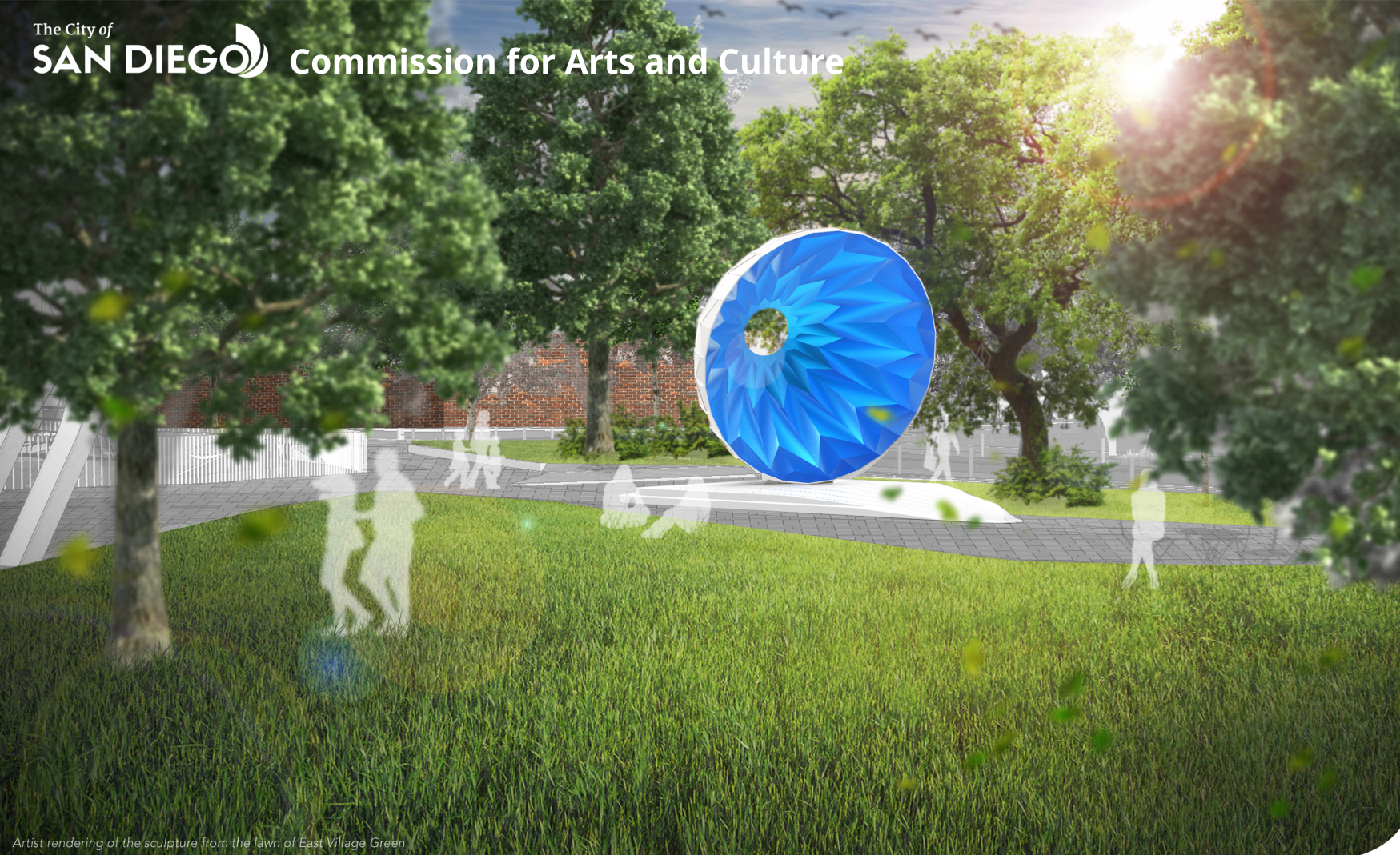
Artist rendering of the sculpture from the lawn of East Village Green