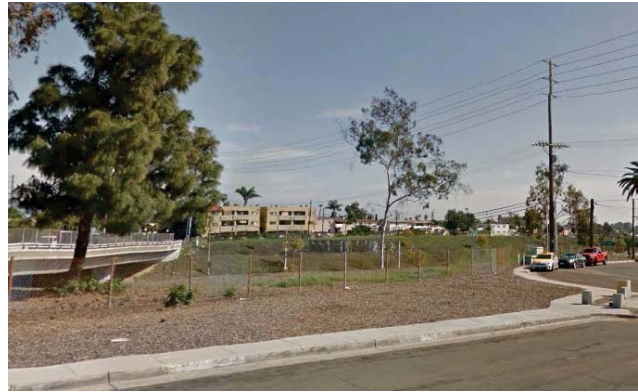
Google Maps: Howard Avenue at 32 nd Street

Up to the amount identified above as the P-15 DIF-basis, DIF revenue may provide funding for design and construction of a pocket park, approximately 0.30 usable acres, which may include passive recreation amenities, seating, pathways, and landscaping. The project site is proposed to be at Howard Avenue and 32nd Street within the Caltrans rights-of-way. The project requires a lease agreement with Caltrans or acquisition of the land, which is not included in the cost estimate.