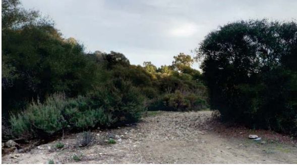
Google Maps: Juniper Canyon

The trail project connects the Juniper Street Crossing of Juniper Canyon to the south terminus of the existing Juniper Street trail.