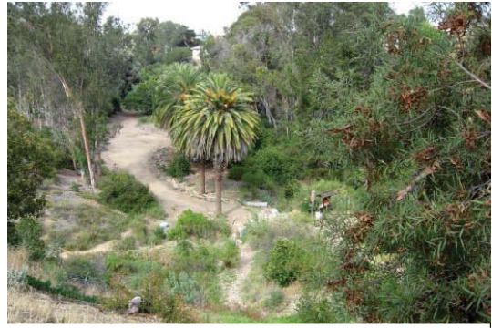
Google Maps: Switzer Canyon