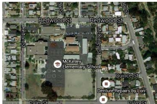
Google Maps: McKinley Elementary School