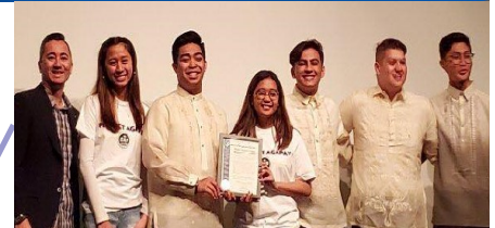
RANCHO PEÑASQUITOS: Recognizing Mt. Carmel High School's Project Agapay.