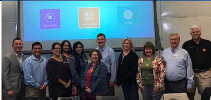
MIRA MESA: Swearing in the Mira Mesa Town Council's 2020 Board of Directors.