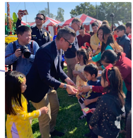
MIRA MESA: At the 5 th Annual San Diego Tet Festival.