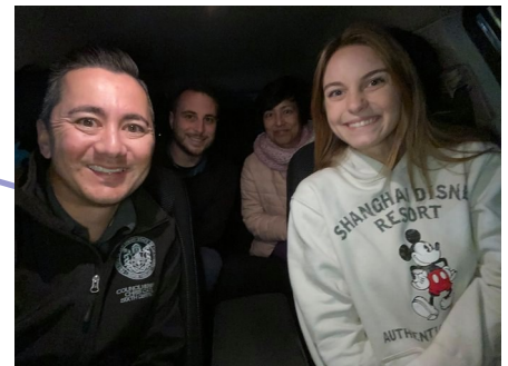
KEARNY MESA: Counting the homeless for the Regional Task Force's annual WeAllCount.