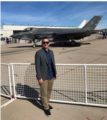
MIRAMAR: At the Introduction Briefing of the F-35.