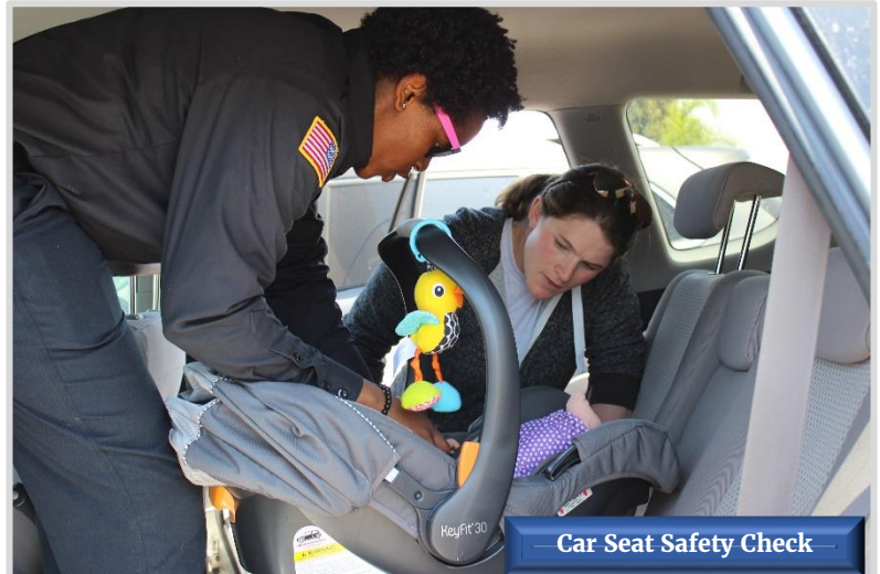
Car Seat Safety Check