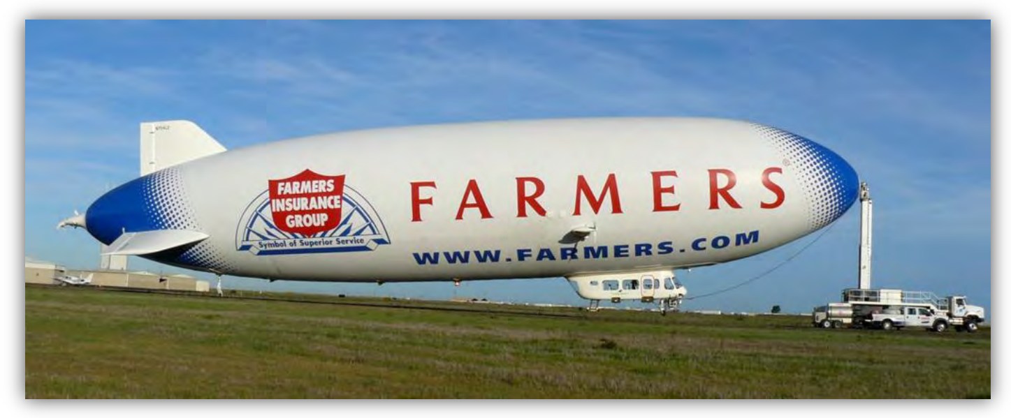
Farmers Zeppelin moored at Brown Field

The Farmers airship "Eureka" moored at Brown Field and provided aerial coverage of the Farmers Insurance Open golf tournament, which was held January 23 – 29 at Torrey Pines. After the golf tournament concluded, the Zeppelin provided rides out of Montgomery Field. Eureka is a Zeppelin NT constructed by the Zeppelin Company in Friedrichshafen, Germany, and operated by Airship Ventures based at Moffett Field, California. It is 246 feet long, 64 feet wide and 57 feet high, with an envelope volume of 296,643 cubic feet and a maximum takeoff weight of 17,725 lbs. Eureka is powered by three Lycoming IO-360 engines, each producing 200 horsepower. Thrust-vectored engines and fly-by-wire technology are employed, giving the Zeppelin the ability to take off and land vertically, and rotate 360 degrees on its axis while hovering. The cabin can accommodate 2 crew and up to 12 passengers.