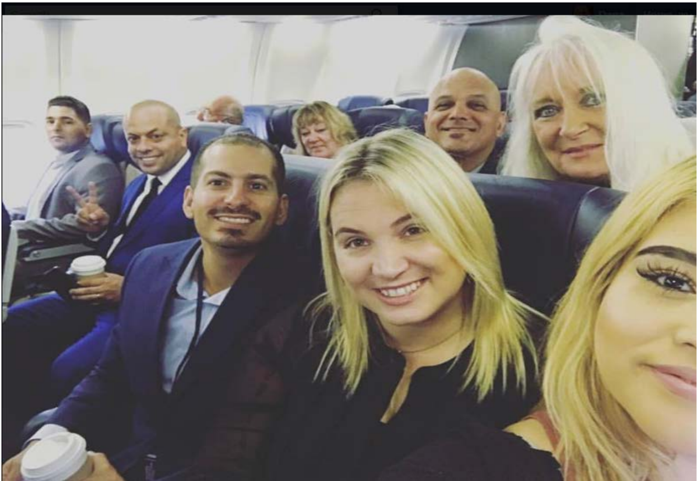
Leaving San Diego airport at 6:45 am en route to Sacramento.