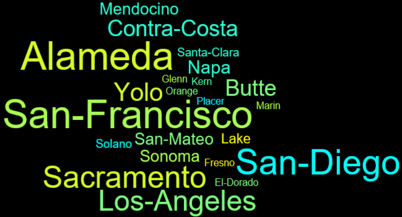
Statewide representation of over 100 individuals representing cities and counties.