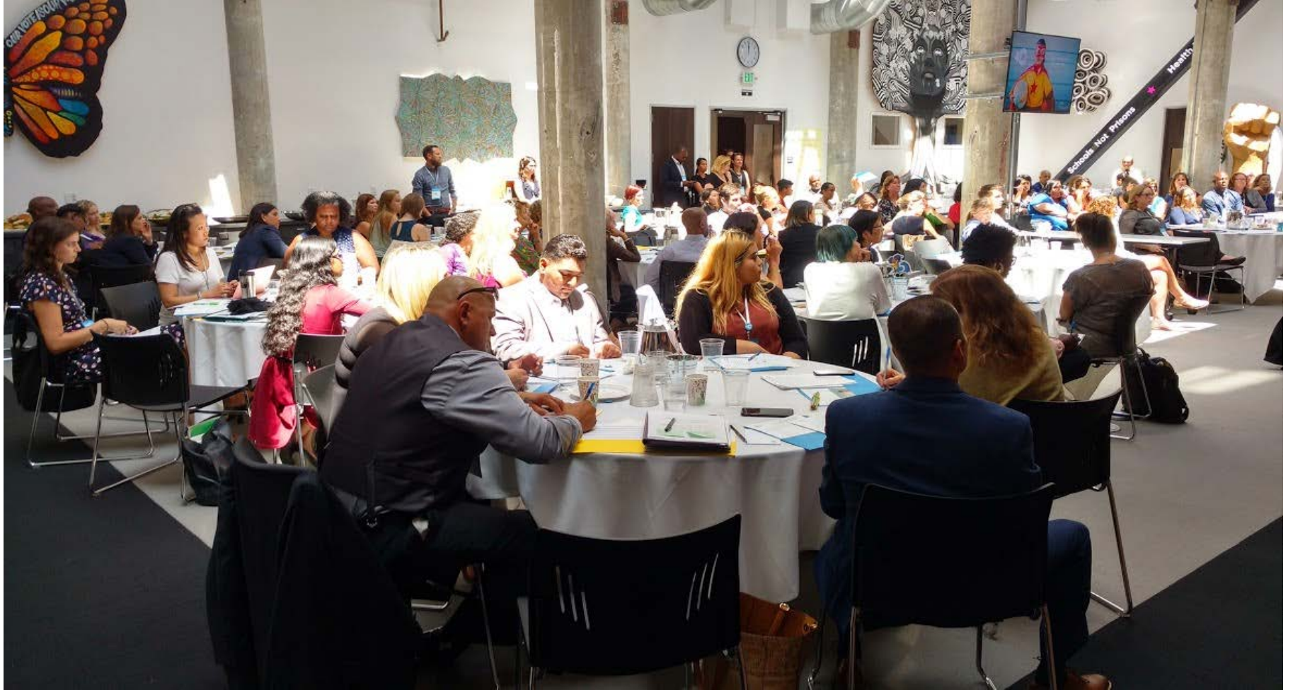
Whole group photo of the morning's learning on the difference between education and lobbying in preparation for meetings with legislative staff all afternoon.