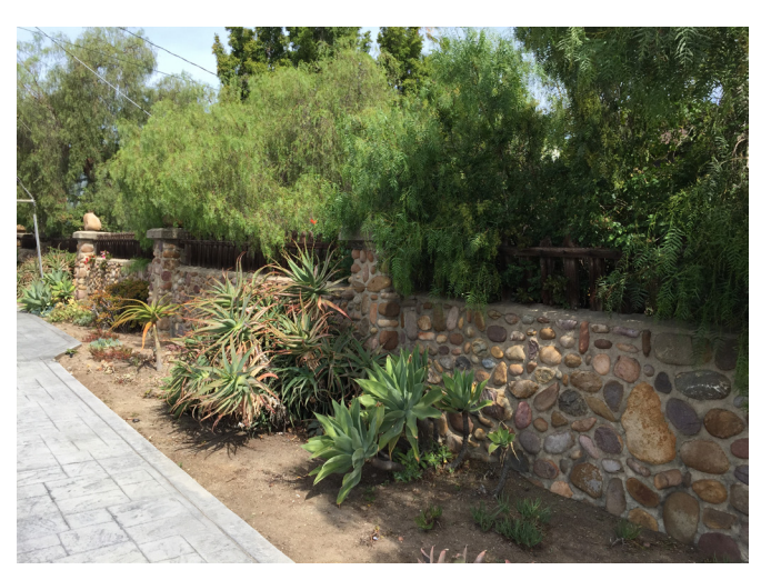
The Mission Cliff Gardens, in University Heights, occupied the cliffs overlooking Mission Valley from 1898 to 1942.

Although San Diego's population rapidly decreased and its real estate plummeted in value, a group of politicians, boosters and entrepreneurs were undaunted and proceeded to initiate a variety of capital improvement projects around the City. With regard to Uptown, these efforts materialized into graded streets, mass transit networks, municipal parks and a state college in the 1890s, all of which facilitated development and helped to shape the Planning Area into an established community. Improvements in transportation infrastructure, in conjunction with the establishment of Mission Cliff Gardens, made the northern reaches of Uptown accessible. Whereas new construction was confined to the area south of Laurel Street in previous years, development activity began to extend into the undeveloped areas of University Heights, Hillcrest and Mission Hills by the turn