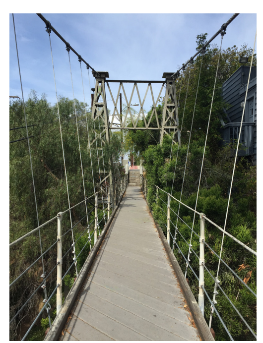
The Spruce Street Bridge, engineered by Edwin Capps, still provides access over Maple Canyon since its completion in 1912.

After World War II, Uptown experienced a number of marked physical changes, due in large part to postwar suburbanization and the preeminence of the automobile. In the late 1940s, San Diego became the first major city in the southwestern United States to decommission its entire network of electric streetcars in exchange for buses. In the postwar era, new commercial development was no longer patterned along streetcar routes, but instead reflected the freedom of movement offered by the automobile. During the 1950s, a variety of carrelated businesses and facilities - including gasoline and service stations, repair garages, body shops, motels and car washes - were constructed in Uptown. Uptown had been largely built out by the 1930s, but construction continued after the Second World War primarily in the form of infill and redevelopment as undeveloped land was in short supply. In the 1950s, many older buildings in the Planning Area were razed and replaced with more contemporary structures. To some degree, Park West, Hillcrest and University Heights were all affected by redevelopment in the postwar years, but Mission Hills experienced comparatively little physical change during this time.