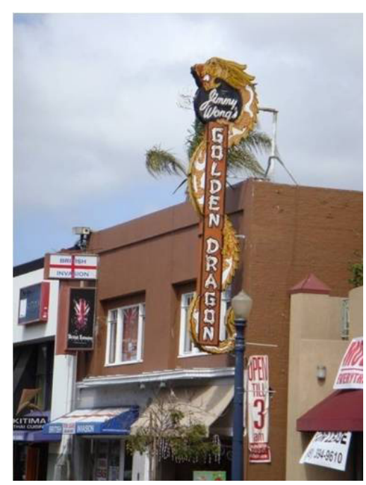
Jimmy Wong's Golden Dragon Neon Sign was designed by immigrant restauranteur Tung Ling "Jimmy" Wong in 1955.

In large part, buildings constructed in Uptown after World War II reflected the shift away from the period revival styles towards more contemporary architectural trends. In addition to several Ranch and Minimal Traditional style houses, Uptown contains some of San Diego's most quintessential examples of Mid-Century Modernism. Given the scarcity of undeveloped real estate, these modern resources were not constructed in contiguous blocks, but were most often interspersed amidst older structures in well-established neighborhoods or on vacant steeply sloping or canyon lots. Between the 1960s and 1970s, the effects of postwar suburbanization took a toll on many of the City's older neighborhoods.