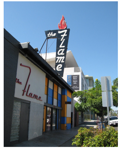
The Flame has been identified as having potential significance to LGBTQ history in the Uptown community.

In addition, the following three (3) potential historic districts have been identified (Table 10-8 and Figure 10-4). These include Allen Terrace, Avalon Heights and Hillcrest. In regard to Hillcrest, it must be noted that the survey work completed in 2004-2006 did not initially identify a potential district in the Hillcrest area. However, the date and reconnaissance nature of the survey significantly limited the evaluation of resources associated with the final theme of revitalization and LGBTQ history. Given the fact that many business catering to and run by members of the LGBTQ community are concentrated within the Hillcrest area, along with residential units occupied by individuals and early advocacy groups, it is appropriate to