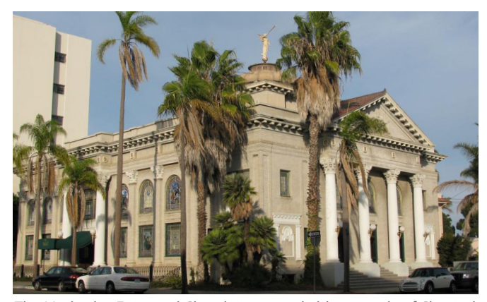
The Methodist Episcopal Church is a remarkable example of Classical Revival architecture in the Bankers Hill/Park West neighborhood.

Figure 10-1) and 2 designated historic districts (Figure 10-2) – Mission Hills and Fort Stockton Line - containing 209 contributing resources that have been listed on the City's register by the Historical Resources Board. These resources reflect a range of property types, from single and multi-family to commercial, hotel, and institutional. Also included are the Quince Street Footbridge, the Spruce Street Suspension Bridge, the First Avenue Bridge, and the Jimmy Wong's Golden Dragon Neon Sign. Seventy-two (72) designated properties reflect the Early Settlement of Uptown, and consist almost entirely of single-family homes, with the exception of the Calvary Cemetery, the Florence Hotel Tree, the Hawthorne Inn, the Quince Street Footbridge, and the First Church of Christ Scientist.