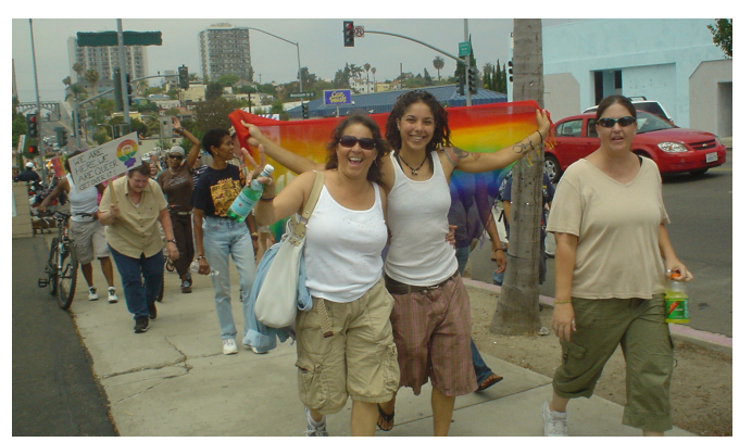
LGBTQ activism in Hillcrest has been a significant facet of Uptown's diverse history.

While the social scene offered by the bars and nightclubs drew the gay community to Hillcrest, the housing opportunities prompted them to stay. The low rate, single occupancy apartments and bungalows that had attracted the elderly were also attractive to gay and lesbian singles and couples, as well as young people and low income families. As Hillcrest emerged as the center of gay life in San Diego, advocacy organizations and support groups were established in and around the Hillcrest community. With limited resources, the LGBTQ businesses and support and advocacy groups that emerged during this time utilized and adaptively reused existing building stock of all eras and styles to meet their needs.