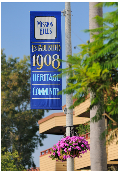
Uptown contains some of the City's historic neighborhoods.

The Archaeological Study describes the pre-history of the Uptown Area; identifies known significant archaeological resources; provides guidance on the identification of possible new resources; and includes recommendations for proper treatment. The Historic Survey Report (consisting of a Historic Context Statement and reconnaissance survey) provides information regarding the significant historical themes in the development of Uptown, the property types associated with those themes, and the location of potential historic resources. These documents, along with the results of extensive community outreach which led to the identification of additional potential historical resources, have been used to inform not only the policies and recommendations of the Historic Preservation Element, but also the land use policies and recommendations throughout the community plan.