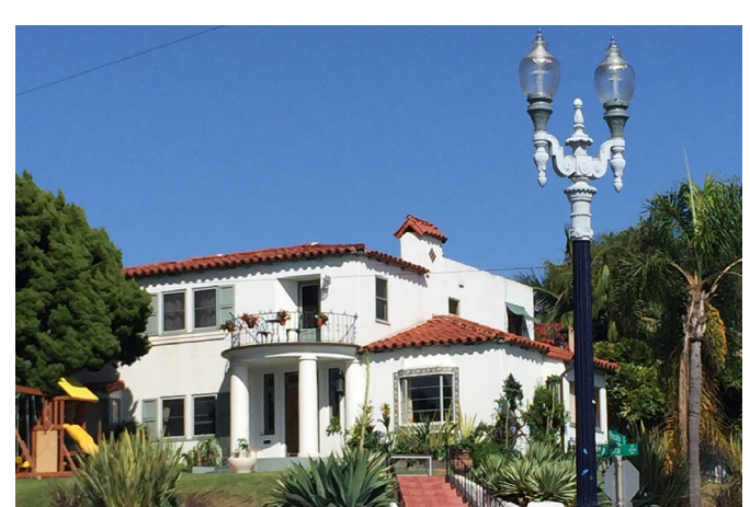
"Acorn" style lighting fixtures contribute to both the historic and pedestrian-oriented nature of designated and potentially historic districts.

There are a number of incentives available to owners of historic resources to assist with the revitalization and adaptive reuse of historic buildings and districts. The California State Historic Building Code provides flexibility in meeting building code requirements for historically designated buildings. Conditional Use Permits are available to allow adaptive reuse of historic structures consistent with the U.S. Secretary of the Interior's Standards and the character of the community. The Mills Act, which is a highly successful incentive, provides property tax relief to owners to help rehabilitate and maintain designated historical resources. Additional incentives recommended in the General Plan, including an architectural assistance program, are being developed and may become available in the future.