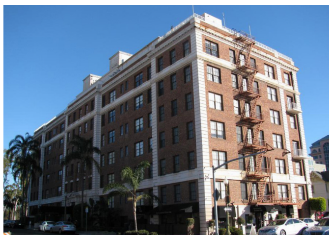
Park Manor, built in 1926, was developed during the expansion of the streetcar, which made development in the community more feasible.

(*The 2004-2006 survey only evaluated properties constructed prior to 1961.)