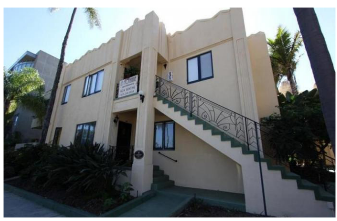
Le Moderne Apartments, built in 1930, is an early and excellent example of the Art Deco Style.

The next wave of activity in the Planning Area was touched off by the Second World War, at which time San Diego was transformed into a thriving metropolitan center and a hub of wartime production. This culminated in a dramatic population increase between 1940 and 1943; wherein defense employees and their families poured into the City at an average of 1,500 people per week. The massive influx of war workers strained San Diego's resources and infrastructure, and by the early 1940s the City experienced a housing shortage unparalleled in its history. To provide the City with critically-needed housing units, the defunct Mission Cliff Gardens was subdivided into 81 parcels in 1942 and was subsequently developed with single family homes. In addition to new construction, the scarcity of housing at this time also facilitated the conversion and subdivision of single family homes. Conversions of this nature occurred almost exclusively in the communities of Park West and Hillcrest, both of which already featured an eclectic mix of residential property types prior to the war. Aside from a limited amount of residential development and the construction of the Cabrillo Parkway (present day State Route 163), Uptown does not appear to have experienced much physical change in the World War II era. This trend occurred citywide and can be attributed to wartime restrictions on building materials, which largely precluded private development at this time.