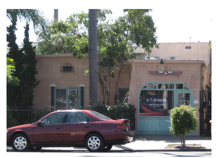
Egyptian Courts Apartments, built in 1925, are located along the Egyptian thematic corridor along Park Boulevard.

A property may be significant under this theme for its association or representation of the limited development in Uptown during the economic Depression of the 1930's and the limited resources of the World War II era, or as the home of an important person in local history. A property may also be significant as a good or rare example of a popular architectural style from the period, such as Spanish Eclectic, Monterey Revival, Minimal Traditional, Streamline Moderne, or Mid-Century Modern. Lastly, a property may be significant if it reflects the notable