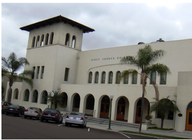
The First Church of Christ Scientist was built in 1909 by Master Architect Irving J. Gill.

A property may be significant under this theme for its association or representation of the postwar development and redevelopment in Uptown, or as the home of an important person in local history. A property may also be significant as a good or rare example of a popular architectural style from the period, primarily Mid-Century Modern. Lastly, a property may be significant if it reflects the notable work of a master builder, architect, or designer. Residential development during the postwar period occurred primarily on undeveloped lots along canyon rims and on lots containing older, smaller homes in communities such as Hillcrest and University Heights, which were demolished to make way for larger homes and apartment buildings in the Mid-Century Modern style. Commercial construction occurred throughout the Planning Area, but was concentrated primarily on redeveloped lots along Washington Street in Mission Hills, Park Boulevard in Hillcrest, and throughout the Park West area along Fourth, Fifth and Sixth avenues. A number of institutional buildings, including the San Diego City School education center, the County Hospital, and a branch library.