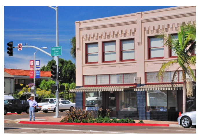
Adaptive reuse of a historic building façade in Mission Hills.

HP-3.2 Partner with local community and historic organizations, including Mission Hills Heritage, Hillcrest History Guild and the University Heights Historical Society, to better inform and educate the public on the merits of historic preservation by providing