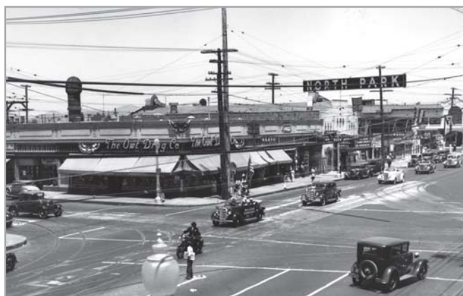
Installed in 1935 above 30th St and University Ave, the North Park Sign is a neighborhood landmark. First replaced in 1949 when the streetcar wires were removed; the current generation of the sign still proudly declares the center of this community.

Along University Avenue, new commercial properties were constructed and existing storefronts were renovated as this area began to shift from a neighborhood retail area to a regional shopping district to compete with the new shopping center in Mission Valley. At the same time, increased reliance on the automobile and local road improvements meant the arrival of new businesses which catered to the needs of the motorist. Auto-related businesses – such as gas stations, car lots, and auto parts stores – began to appear alongside