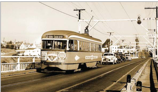
The image above shows the No. 2 trolley line crossing Switzer Canyon during the 1940s enroute to Golden Hill and eventually terminating at Broadway and Fifth Ave Downtown.

In the mid-19th century, San Diego had approximately 650 residents of record and an unknown indigenous population. However, new arrivals were transforming the small Mexican community into a growing commercial center. In 1867, Alonzo Erastus Horton acquired nearly 1,000 acres of land two miles south of "Old Town", where downtown San Diego sits today. Dubbed "New San Diego", Horton orchestrated the creation of a new downtown, relocating the city's first bank, main newspaper, and several government buildings to this site. Thus Old Town was supplanted as the City's primary commercial center. The arrival of the railroad in the 1880s linked San Diego with the eastern United States and sparked its first building boom. By 1887, San Diego's population had spiked to 40,000, and large tracts of new development began to appear on the hills immediately adjacent to Downtown.