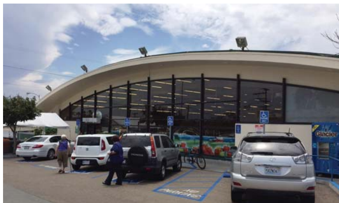
4175 Park Boulevard, an identified potentially significant individual resource in the community was built in 1965 represents the Googie architectural style.

A property may be significant under this theme for its association with important trends and patterns of development in North Park during this period, including the postwar economic and building boom; patterns of infill development in established neighborhoods; the proliferation of the “minimum house”; or the development of automobile corridors. A property may also be significant as a good or rare example of a popular architectural style from the period, such as Minimal Traditional, Ranch, Modern or Googie. Extant property types may include single family residences; multi-family residences (residential courts, courtyard apartments, and stucco box and apartment tower); commercial buildings; and civic and institutional facilities.