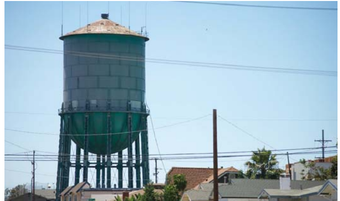
The University Heights Water Storage and Pumping Station Historic District is listed on the National Historic Register of Historic Places.

Substantial civic and institutional development took place in North Park throughout the 1920s. During this period, the community received its first localized branches of public services, including a fire station and a post office. Several educational facilities were established, including Park Villas Elementary School and Jefferson Elementary school, as well as two private