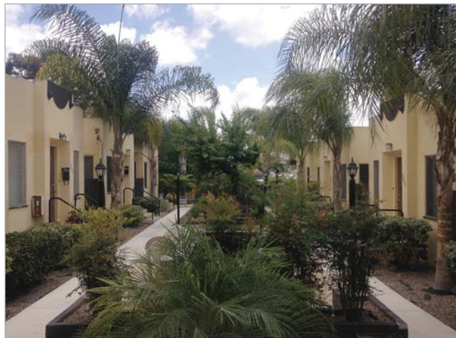
This type of courtyard apartments/bungalow courtyards became a popular form of housing in North Park during its greatest economic building boom that saw the completion of the streetcar system, and the 1915 Panama-California Exposition.

In addition to direct incentives to owners of designated historical resources, all members of the community enjoy the benefits of historic preservation through reinvestment of individual property tax savings into historical properties, and an increased historic tourism economy. There is great opportunity to build on the existing local patronage and tourism base drawn to the community's neighborhoods and shopping districts by highlighting and celebrating the rich history of North