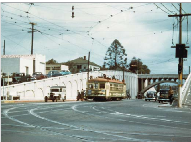
The Georgia Street Bridge, built in 1914, is listed on the City of San Diego Historic Resources Register.

An Archaeological Study (Appendix C) and Historic Survey Report (Appendix D) were prepared in conjunction with the Community Plan. The Archaeological Study (Appendix C) describes the pre-history of the North Park Area; identifies known significant archaeological resources; provides guidance on the identification of possible new resources; and includes recommendations for proper treatment. The Historic Survey Report in Appendix D (consisting of a Historic Context Statement and reconnaissance survey) provides information regarding the significant historical themes in the development of North Park, the property types associated with those themes, and the location of potential historic resources. These documents, along with the results of extensive community outreach which led to the identification of additional potential historical resources, have been used to inform not only the policies and recommendations of the Historic Preservation Element, but also the land use policies and recommendations throughout the Community Plan.