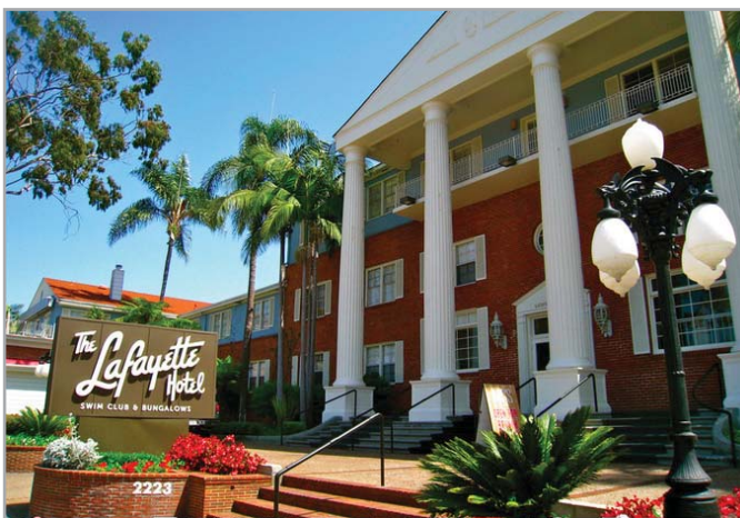
The Lafayette Hotel, originally named Imig Manor, was built in 1945, and is listed on the National Register of Historic Places.