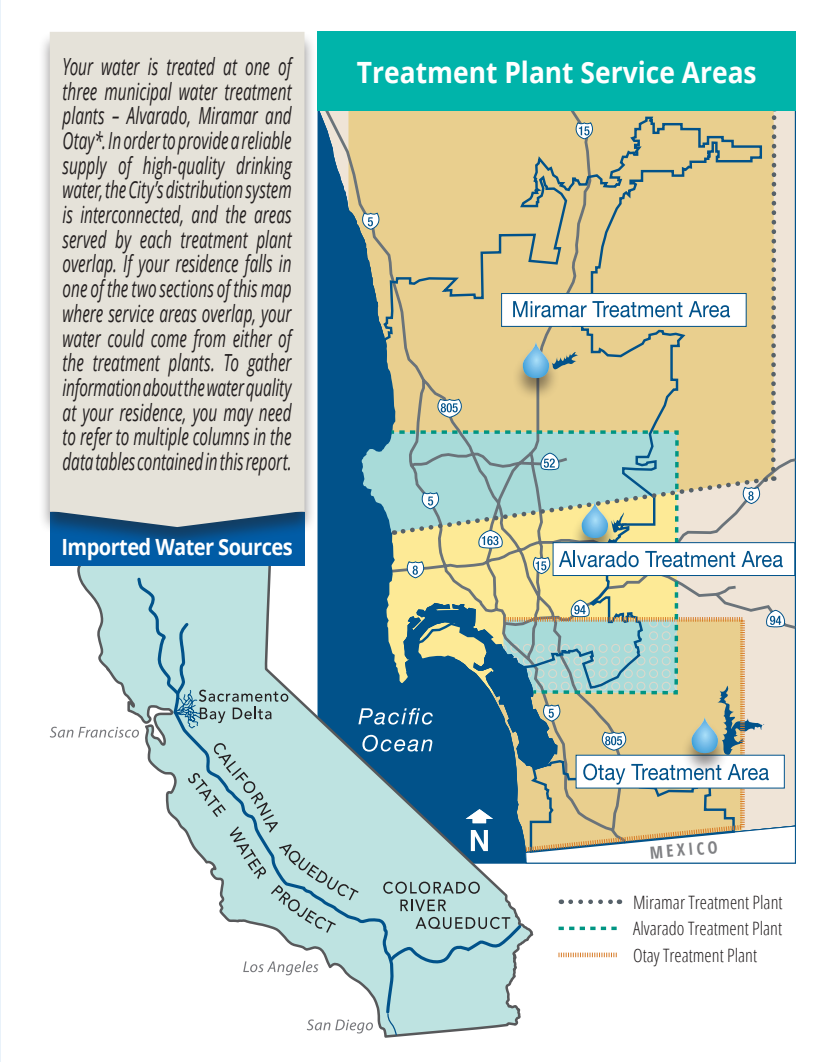
*A small portion is treated water supplied by Metropolitan Water District's Skinner Water Treatment Plant and the San Diego County Water Authority's Twin Oaks and Carlsbad Desalination water treatment plants.

Throughout the year, the ratio of water from each source changes. The constituents that make up the City's source water are influenced by the water source, climate, geology and the land activities that they flow through. The City continually monitors the source water and adjusts its treatment process to ensure that the water is always healthy and safe.