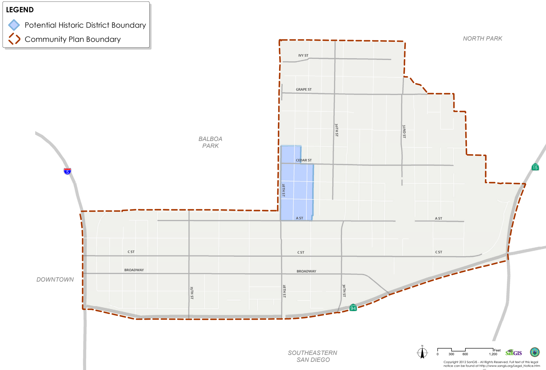
FIGURE 10-3: LOCATION OF POTENTIAL SOUTH PARK HISTORIC DISTRICT IDENTIFIED IN THE HISTORICAL RESOURCE RECONNAISSANCE SURVEY