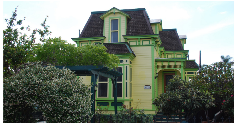
The property on 1930 30th St. is a single-family residence, built in 1900, identified as a potentially significant individual resource related to the Elite Residential District theme.

Despite the collapse of the Great Boom, the events of the 1880s had left San Diego with an element of population and wealth. In 1895, a group of investors purchased forty acres within Golden Hill, bounded by 24th, 25th, “A” and “E” streets, and thereafter filed a subdivision map for the Golden Hill Addition. In subsequent years, Golden Hill was transformed into an established residential district. Beginning in 1895, many of San Diego’s most prominent citizens, including doctors, lawyers, businessmen and politicians, purchased lots and constructed homes within Golden Hill Addition. The majority of the early homes in Golden Hill were styled in accordance with Victorian principles. These homes embodied many of the character-defining features of Victorian residential architecture, including irregular floor plans; wrap-around porches; steeply pitched, gabled roofs; and richly embellished façades. Along with the Victorian style, homes constructed in Golden Hill near the turn of the twentieth century were also designed in the Classical Revival style.