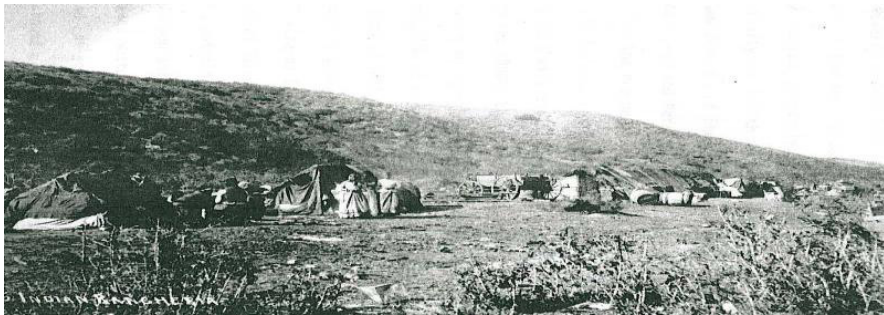
Indian Rancherias near Golden Hill.

Aside from the Indian rancheria, little development occurred in Golden Hill until Alonzo Horton purchased one thousand acres of real estate and