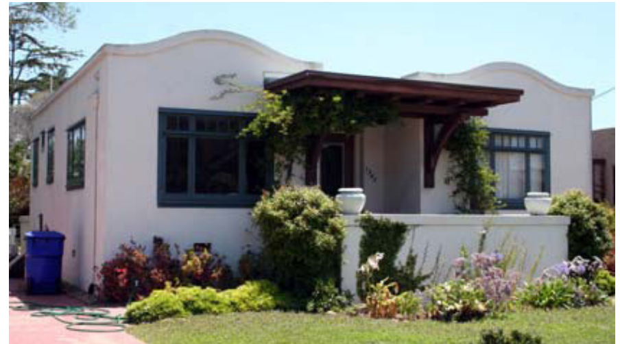
The property on 1345 Granada Ave. is designated as HRB site #612 and was designed by Master Architect Irving Gill in 1909.

The next wave of activity within the community was touched off by the Second World War, as San Diego emerged as a hub of wartime production and the population grew rapidly at an average rate of 1,500 people per week between 1940 and 1943. The massive influx of war workers strained San Diego's resources and infrastructure, and the City thereafter