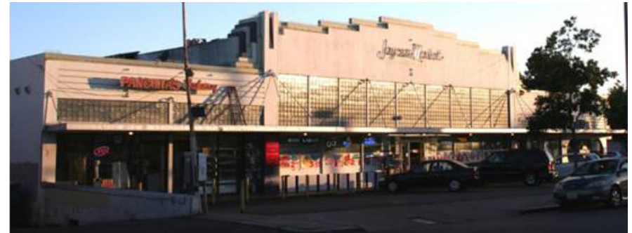
The property on 2505-2519 C Street, built in 1930, has been identified as a potentially significant individual resource related to the Streetcar Development theme.

The potential historical resources identified by the Historical Resource Reconnaissance Survey and the public outreach process are protected and preserved to some degree through existing General Plan policies and the Historical Resources Regulations of the Municipal Code. In addition, to ensure the protection of potential historic districts identified from erosion due to insensitive redevelopment, interim protection regulations shall be established to assist in the preservation of the overall integrity of potential historic districts until such time as they can be intensively surveyed, verified, and brought forward for historic designation consistent with City regulations and procedures.