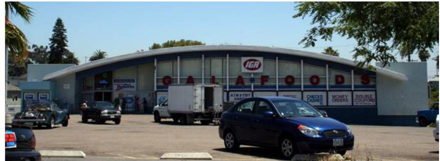
The property on 2001 Fern Street, built in 1960, has been identified as a potentially significant individual resource related to the Era of Transitions Theme (1930-1990).

Interest in Golden Hill was regenerated in the 1970s, when two national oil crises steered many middle-class professionals back into centralized, inner-city neighborhoods. As homeownership in Golden Hill steadily increased throughout the 1980s, a growing desire emerged among residents to eradicate blight, reduce density and restore the community’s historic character. In 1978, the City’s Historical Resources Board designated the Golden Hill Historic District, a six block area bounded by Balboa Park on the north, 25th Street on the east, F Street on the south, and 24th Street on the west. Following the designation of the district, property owners and community members made a concerted effort to preserve and embrace the heritage and built environment of Golden Hill.