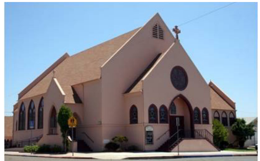
The Christ United Presbyterian Church, located on 3025 Fir Street, has been identified as a potentially significant individual resource.