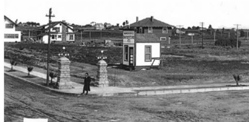
28th Street and A Street, 1906.

pathways and tennis courts. To better serve the recreational needs of the growing community, residents also financed the construction of a golf course, an aviary, a bandstand for weekend concerts and San Diego's first park playground.