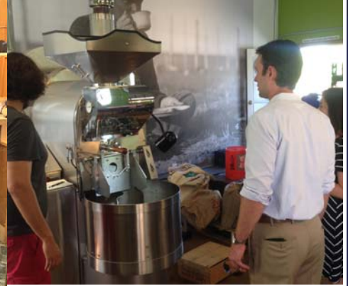
Touring Manzanita Roasting Company in Rancho Bernardo.