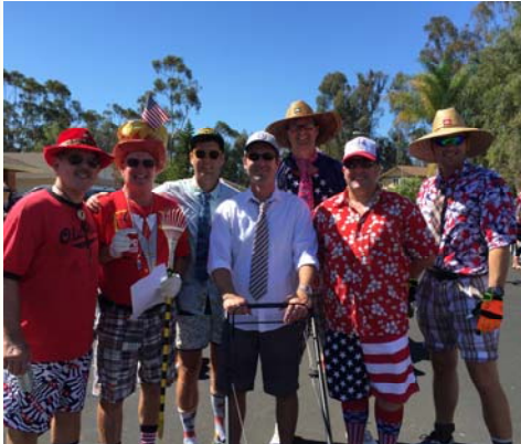
With the Scripps Ranch Old Pros at the annual Fourth of July parade.