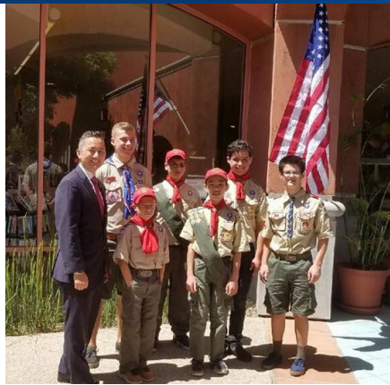
RANCHO PEÑASQUITOS: On June 14 th , the Boy Scouts (Rancho Mesa) and I celebrated Flag Day by having American Flags installed at all City libraries.