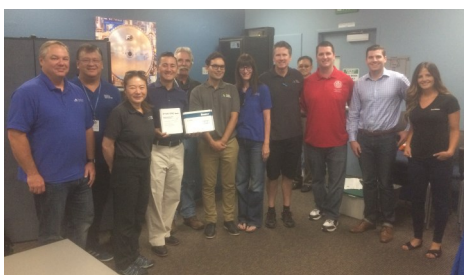
KEARNY MESA: On June 24 th , we kicked off our million gallon challenge by distributing FREE weather-based irrigation controllers and $100 rebates. The weather-based irrigation controller systems that are part of this pilot program could save one million gallons of water annually.