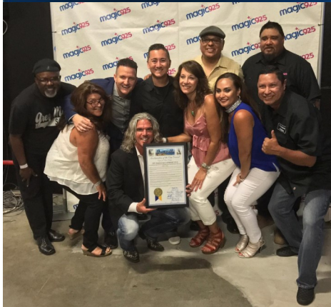
SORRENTO VALLEY: Magic 92.5 celebrated their 20 th anniversary with a star-studded celebration. I was honored to proclaim June 17, 2017 as "Magic 92.5 San Diego Day" in the City of San Diego.