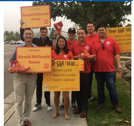
MIRA MESA: On June 22 nd , our D6 team volunteered with Ronald McDonald House Charities of San Diego for Red Shoe Day . Our shoes were filled with donations that help kids and families in need.