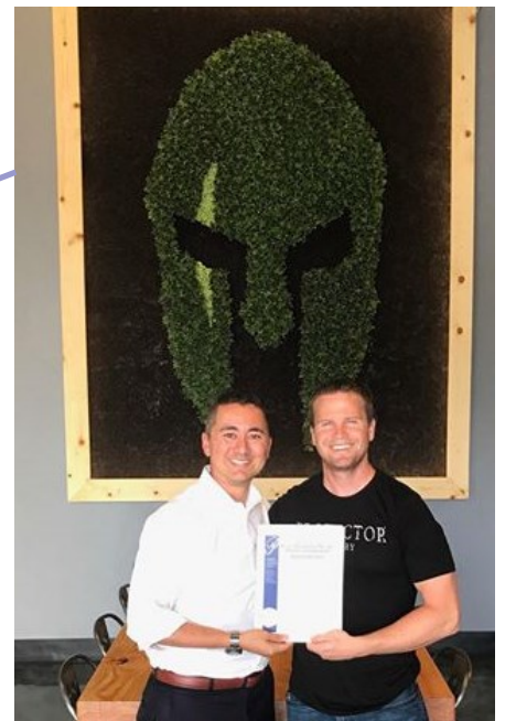
MIRAMAR: On June 8 th , I toured Protector Brewery . They're San Diego's first organic craft beer company.