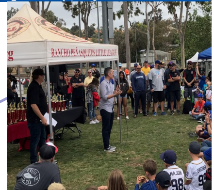
RANCHO PEÑASQUITOS: Thank you to the Rancho Peñasquitos Little League for inviting me to their Closing Ceremony. Little League builds confidence, teaches teamwork, and instills character values.