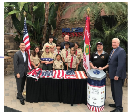
FLAG RETIREMENT BOXES: Beginning July 5 th , libraries throughout the San Diego region will display a flag disposal box. These boxes will allow residents to properly dispose of U.S. flags.