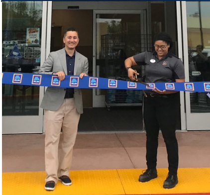
MIRA MESA: Welcome to District 6, ALDI! ALDI is committed to providing high-quality food at an affordable price to San Diegans.