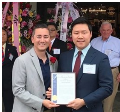
KEARNY MESA: Honored to celebrate the Grand Opening of HMart . Since 1980, HMart has made a promise of providing fresh, superior Korean food and service within the community.