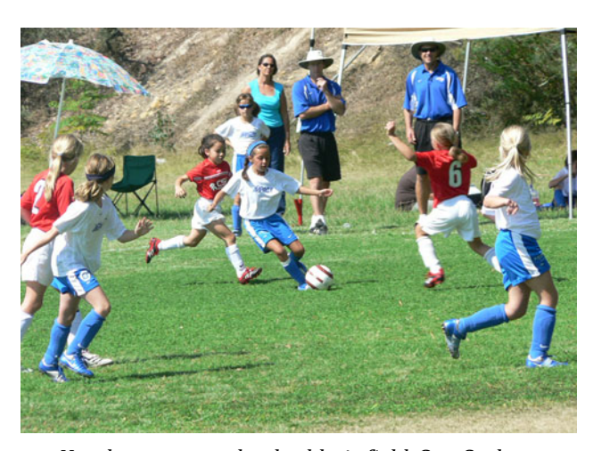
Youth soccer at school athletic field, San Carlos

Creative methods for cost-effective and efficient use of public lands are required if recreation facilities are to be improved, enhanced, and expanded to meet existing and future needs. San Diego's expanding urban development and its desire to acquire, protect and preserve parkland, recreation facilities, and open space have limited the availability of, and placed constraints on, developable lands. One creative means of providing additional lands and facilities for public recreation use is through joint use of public and not-for-profit facilities such as parks, swimming pools, and schools. Joint use facilities can include any land area or physical