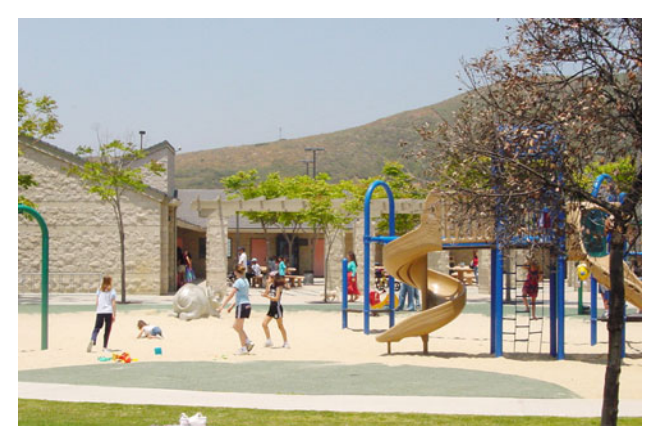
Hilltop Community Park, Rancho Peñasquitos

Population-based parks (commonly known as Neighborhood and Community parks), facilities and services are located in close