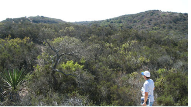
preservation of open space.