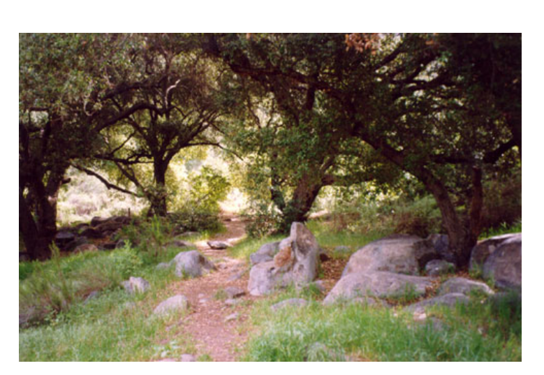
Mission Trails Regional Park

The City of San Diego has over 38,930 acres of park and open space lands that offer a diverse range of recreational opportunities. The City's parks, open space, trails, and recreation facilities annually serve millions of residents and visitors and play an important role in the physical, mental, social, and environmental health of the City and its residents. Parks can improve the quality of life by strengthening the body and assisting in maintaining physical well-being. Mental and social