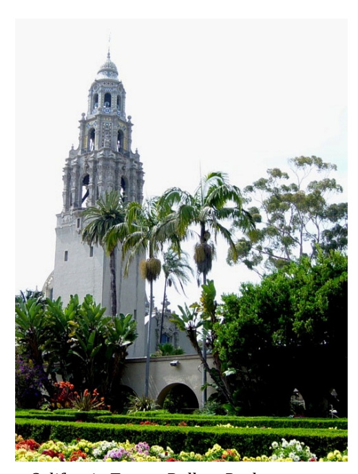
California Tower, Balboa Park

Key to the preservation and enhancement of open space and parkland is the use of the City's resource-based parks which are home to many of the City's cultural and natural