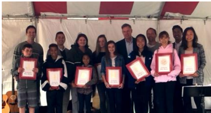
22nd Fiesta de los Peñasquitos

Awarding students from Rancho Peñasquitos schools for their community service.