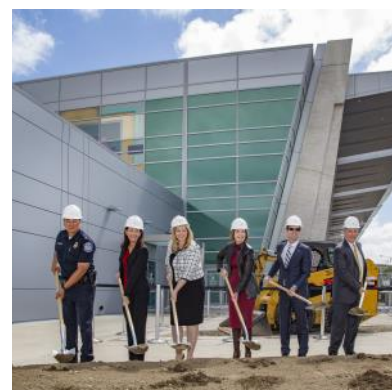
Breaking ground on the San Diego International Airport's new Federal Inspection Station.

Reading to kindergarteners at Walker Child Development Center.