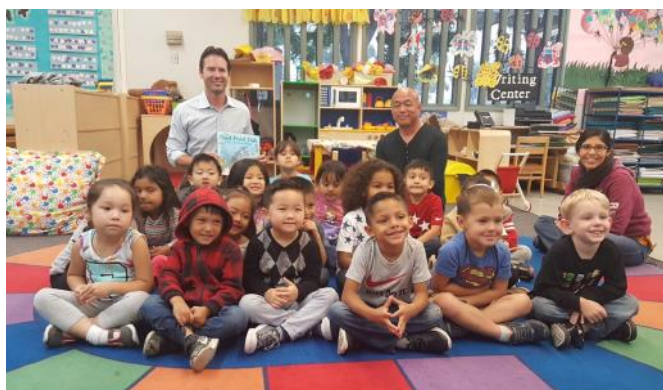
Share Your Love of Reading

Supporting bike commuters in D5 for Bike to Work Day.