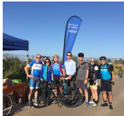
Bike to Work Day

Awarding students from Rancho Peñasquitos schools for their community service.