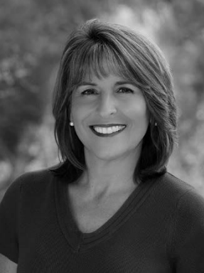
LORIE ZAPP San Diego City Councilmember