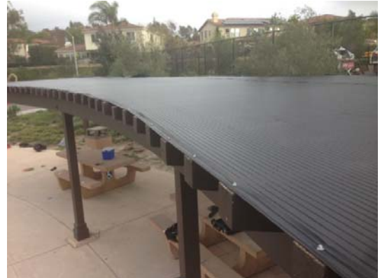
The new shade cover and newly painted arbor at South Village Park in Black Mountain Ranch.