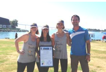
With the owners of The Dailey Method at their first DaileyFest