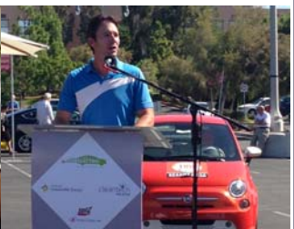
Speaking at San Diego's 3rd Annual Electric Vehicle Day