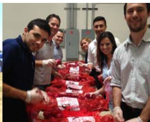
Volunteering with my staff at the San Diego Food Bank