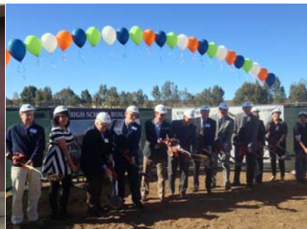
Attending a ground breaking for Maranatha Christian Schools new high school campus in the Del Sur/4S Ranch area.