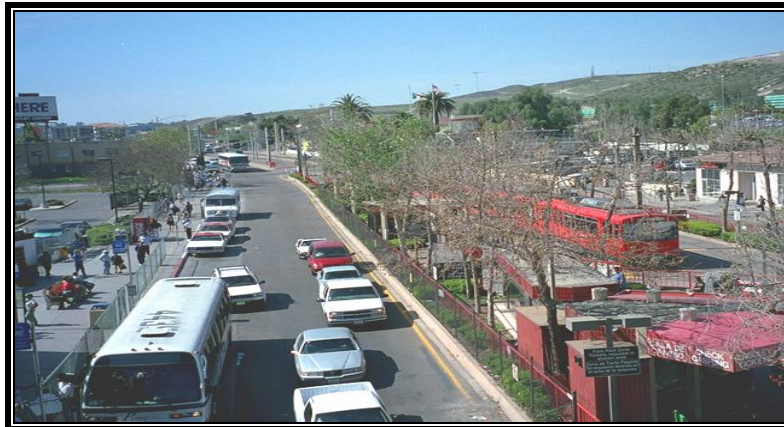
San Ysidro Trolley Station 1999