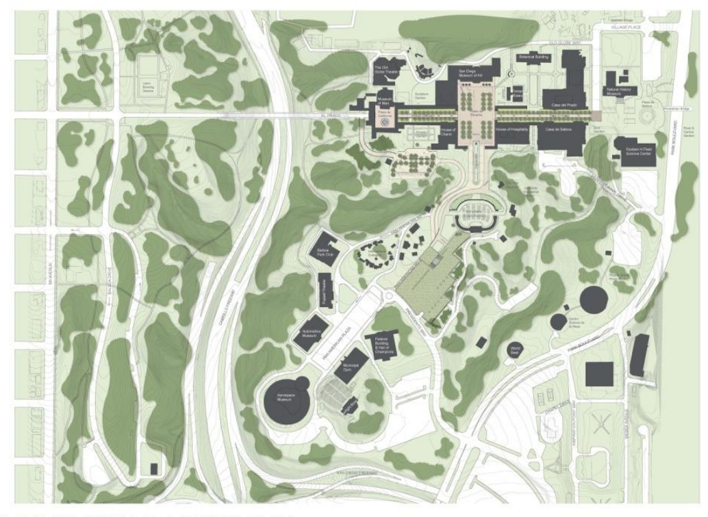
PLAZA DE PANAMA | VISION PLAN PLAZA DE PANAMA COMMITTEE