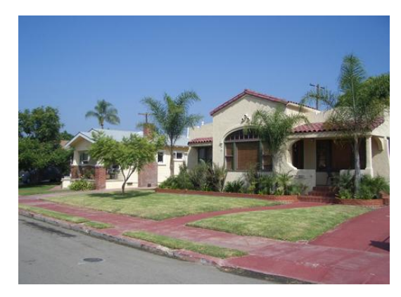
Burlingame Historic District

enhances quality of life and community character. Rehabilitation Tax Credits provide a ten or twenty percent tax credit on rehabilitation spending for income producing properties eligible