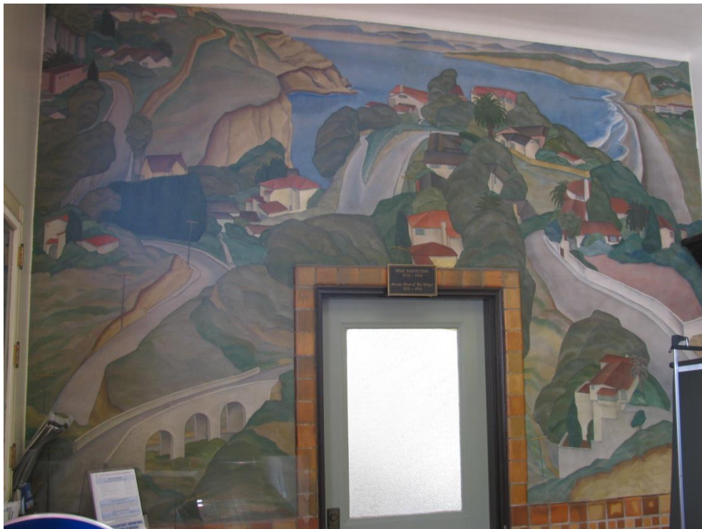
East facing wall, west end of Public Lobby, March 2013