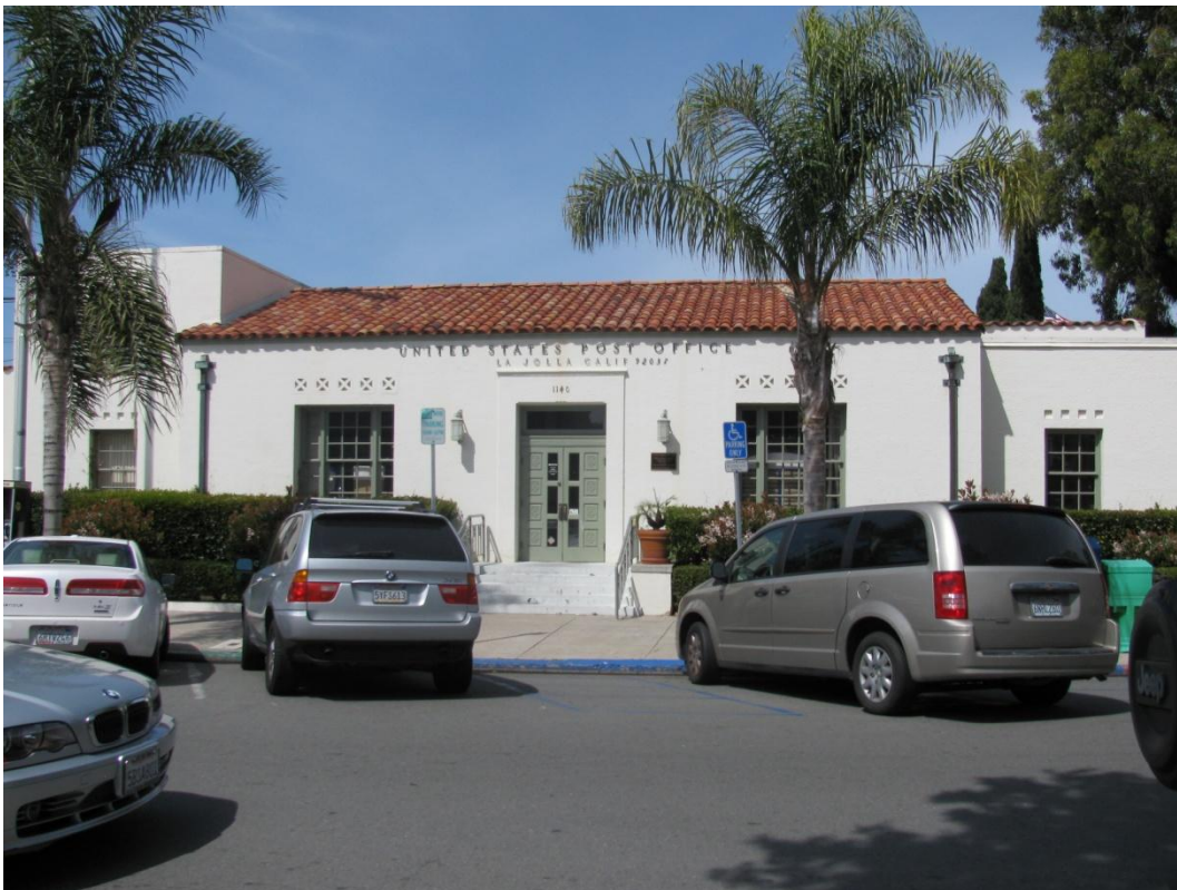
South elevation, March 2013