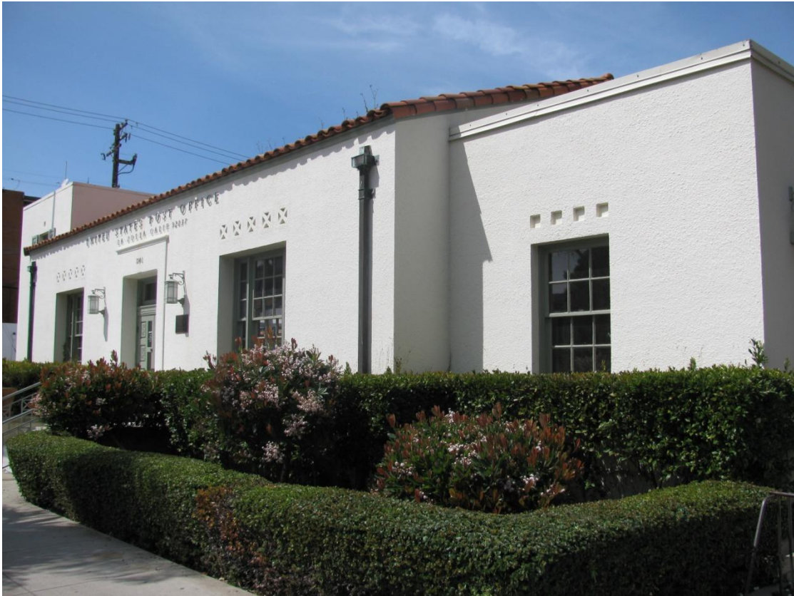
East end, south elevation, March 2013