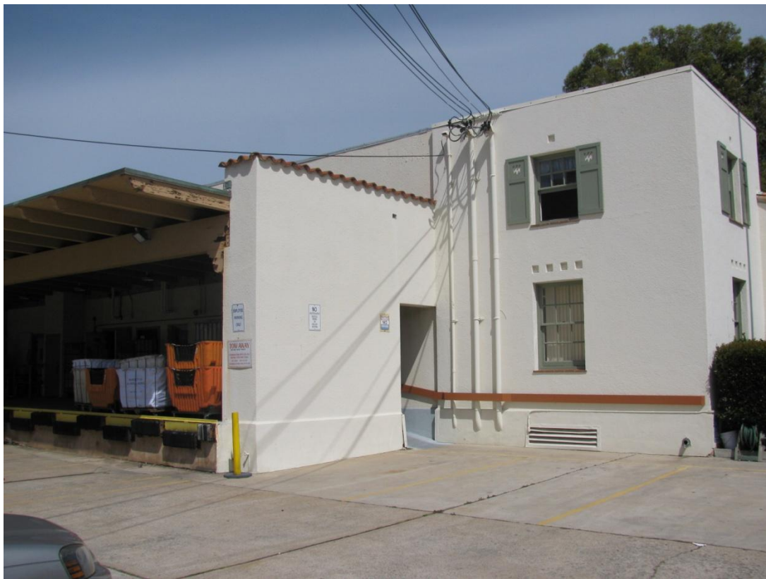
West elevation, March 2013