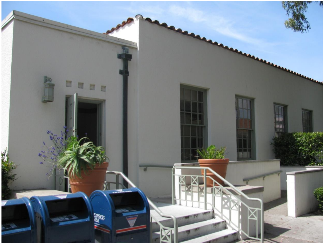
East elevation, March 2013