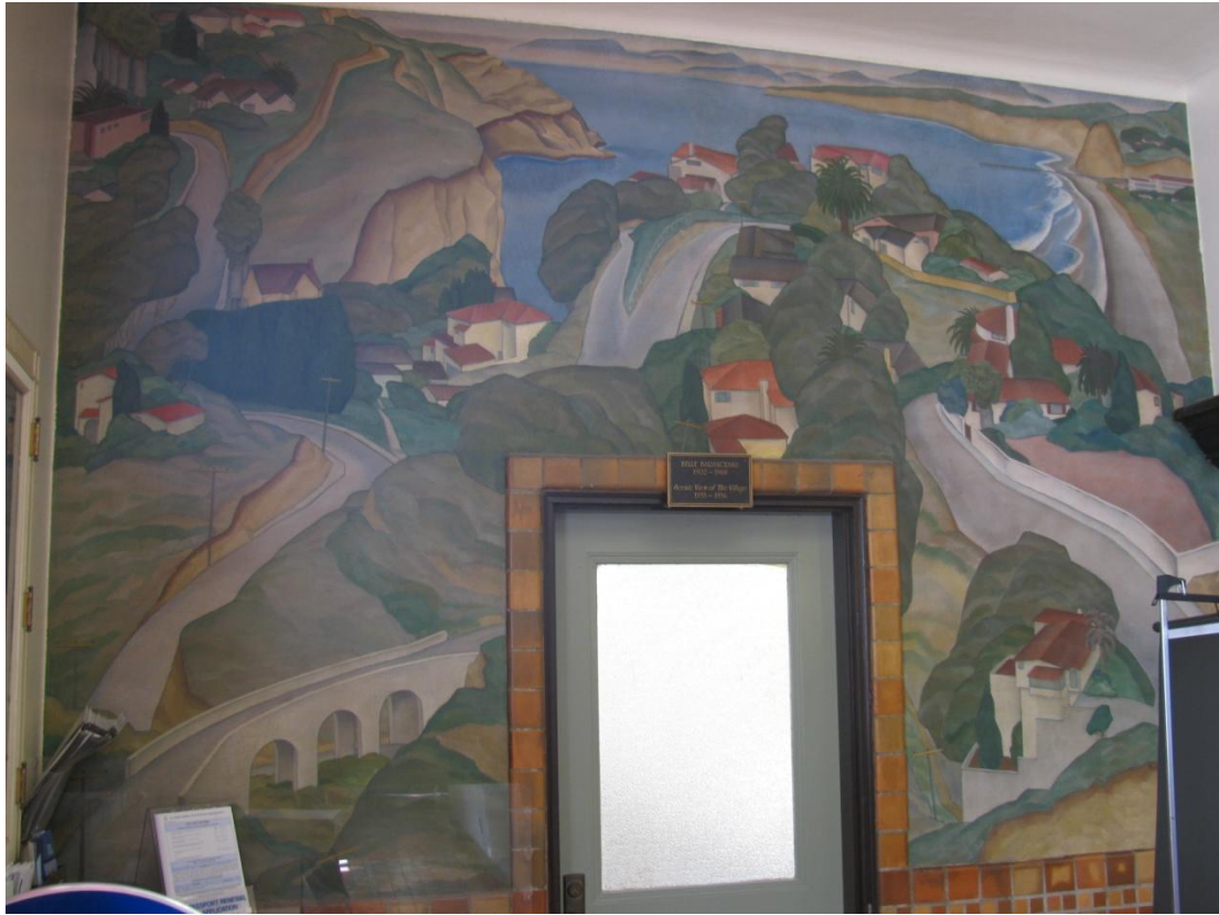
West end, Lobby interior, March 2013