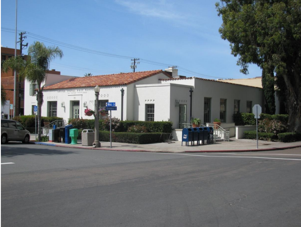
South and east elevations, March 2013