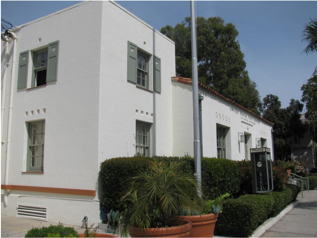
West end, south elevation, March 2013