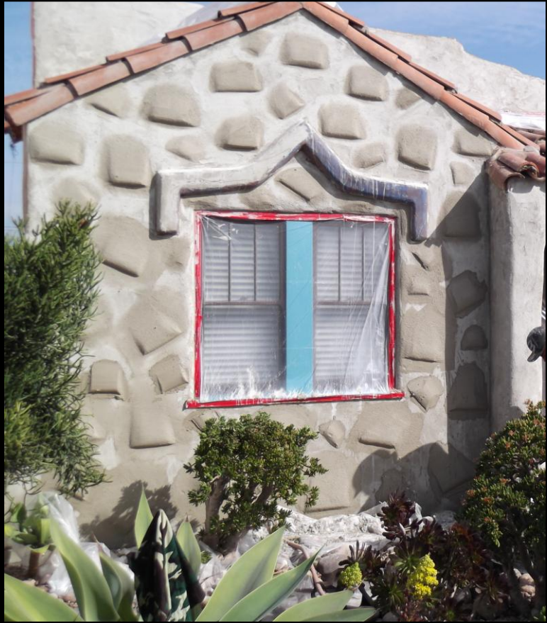
Figure 3 and 4 3127 McKinley Street front façade during restoration. Raised hand troweled finish shown with red arrow. Photo above circa 1938. Photo below left by Kiley Wallace, February 2015.