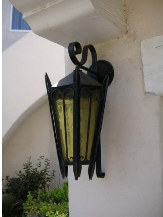
Photo 15: Corbel and original electric lamp on southwest elevation of garage.

* Recorded by: R. Cromwell, Heritage Architecture & Planning *Date: 07.25.08 Continuation Update