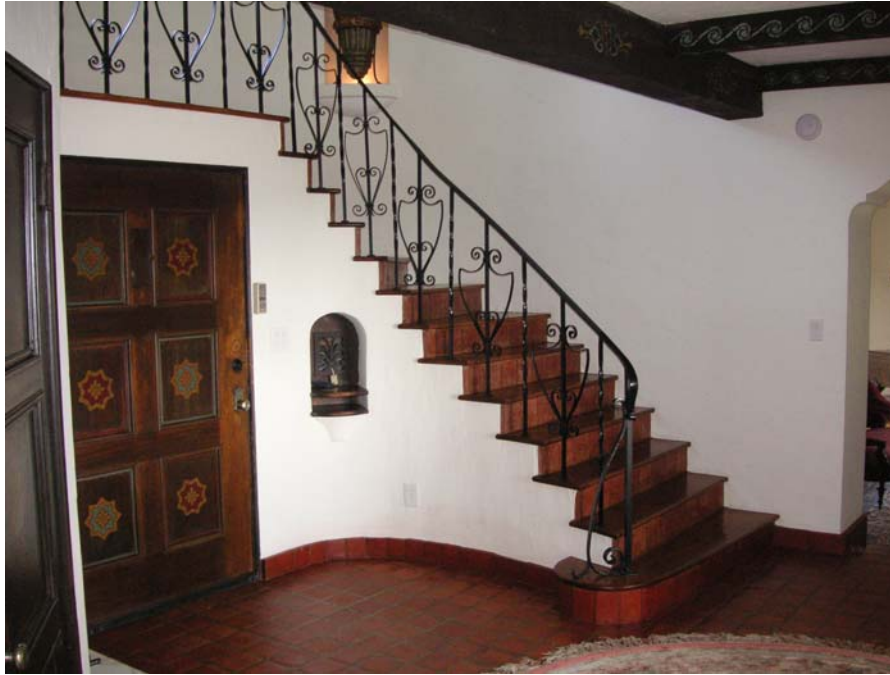
Photo 1: Original stairway and main entry lobby with Requa-style expression reflected in doors, historic tile work, and railings.

* Recorded by: R. Cromwell, Heritage Architecture & Planning *Date: 07.25.08 ■ Continuation □ Update