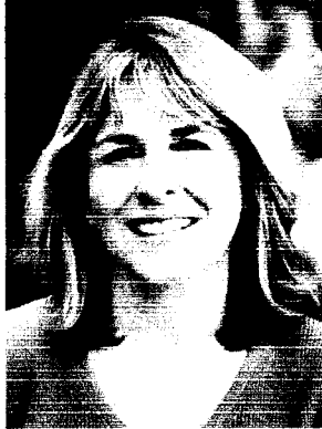
LORIE ZAPF San Diego City Councilmember