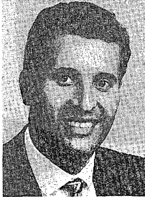
JUAN VARGAS Harvard Educated Attorney

I was born and raised in San Diego. I graduated from the University of San Diego, entered the Jesuit seminary and studied to be a Catholic priest. After four years, I left the seminary because I wanted to have a family.