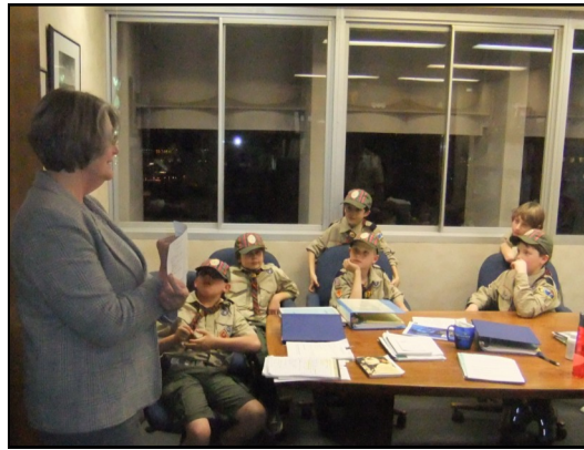
Boy Scouts from Troop 4 in La Jolla visited Sherri's office on January 11th. Troop 4 is the oldest Boy Scout troop west of the Mississippi.