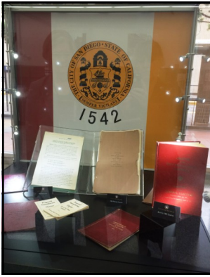
The City of San Diego celebrated Charter Day on Tuesday April 7th.

The May 14 th Charter Review Committee topics included the 2/3 voter approval requirements for the issuance of bonds, and whether it should vary depending on the type of bond issued. The Committee discussed that the Charter sets aside money received from utility franchise fees for debt service on open space bonds, but there have not been any open space bonds for several years, and none are anticipated. The item was referred to the Envi-