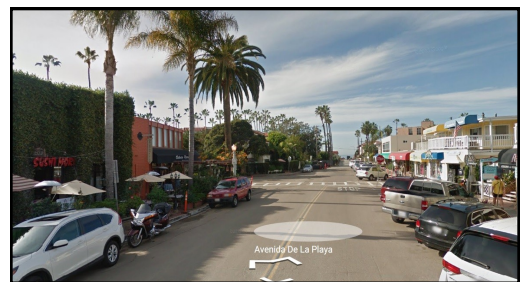
Businesses along Ave de la Playa include restaurants (both casual and fine dining), kayak and bike rentals, surf shops (many offer lessons), hotels and various retail stores and professional services, including financial, medical and legal.

For information: Visit the La Jolla Shores Business Association online at enjoylajollashores.com , call (858) 869-1096 or email at enjoylajollashores@gmail.com .