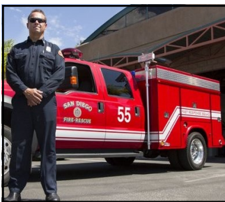
A FAST response squad, with a 2 person crew, dubbed a "mini fire engine" is proposed for South University City.

During the first week of May, the City Council reviewed the Mayor's FY16 Proposed Budget. Council District One will benefit from several items where funding has been either reallocated, continued or newly provided.