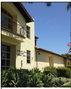
La Jolla/Riford Library will remain open after Thanksgiving.

San Diego public libraries will have special hours during the week of Thanksgiving. Please make note of these changes and plan your trip to the library accordingly: