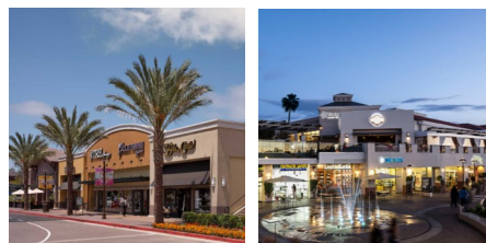
Flower Hill Promenade and Del Mar Highlands Town Center