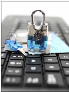
Keep your information safe this holiday season.

This year, millions of Americans will turn to the internet for some or all of their holiday shopping. While this shopping method may offer convenience, it can also open the door to hackers and identity thieves. Help protect yourself from online predators by taking the following steps: