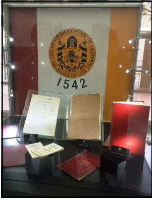
The City's original Charter is on display as part of the City's collection.

At the December 3 meeting, the Committee will consider recommendations regarding the Ethics Commission, Planning Commission, Article V sections on Executive and Administrative Services, Article VII sections on Finance, Retirement, Civil Service, Contracting, and a proposed Preamble.