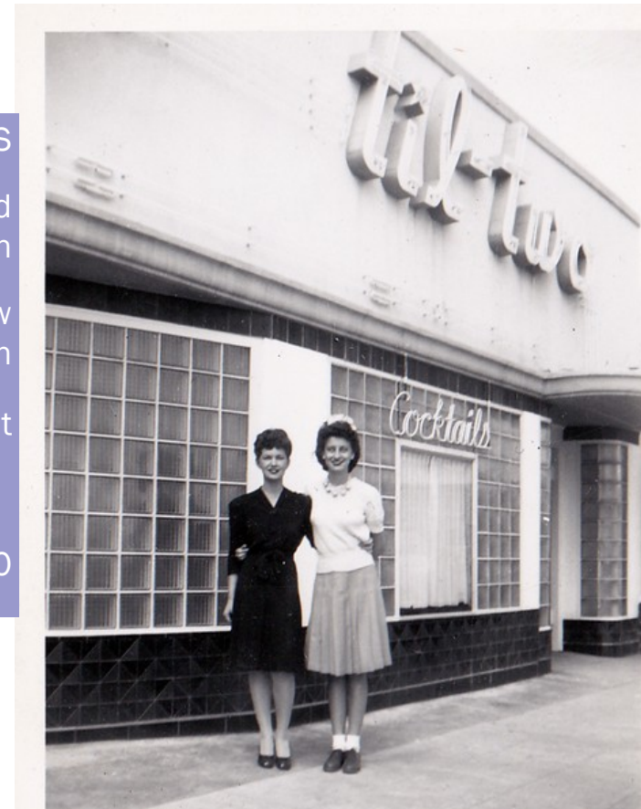
Historic photo, above.

IMPROVEMENTS Neon fabrication and installation Glass block window restoration New paint TOTAL COST: $12,400