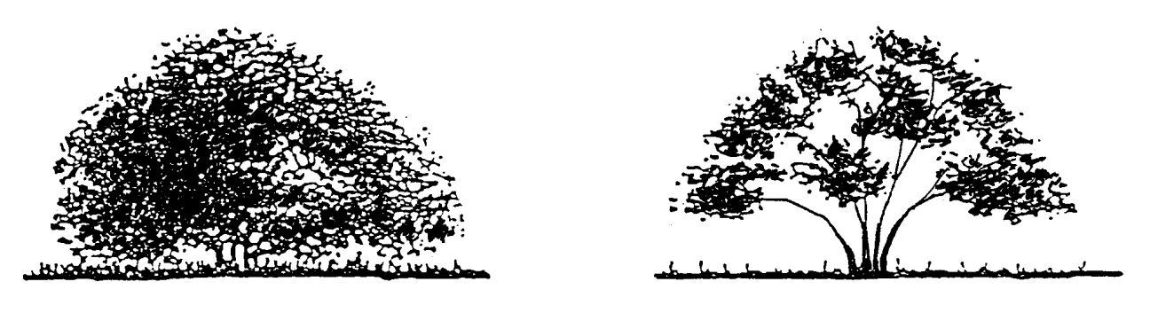
Chaparral Plant Before Pruning

Remaining plants, 4 feet or more in height, should then be cut and shaped into "umbrellas." This means pruning one half of the lower branches to create umbrella-shaped canopies. This allows you to see and deal with what is growing underneath. Upper branches may then be shortened to reduce fuel load as long as the canopy is left intact. This keeps the plant healthy and the shade from the plant canopy reduces weed and plant growth underneath. Vegetation that is less than 4 feet in height, like coastal sage scrub, should be cut back to within 12 inches of the root crown.