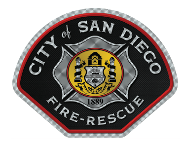
Published by San Diego Fire-Rescue Department Revised 11/05/2019