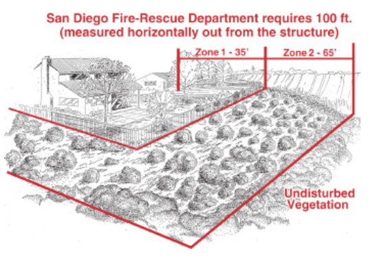
Before Brush Management