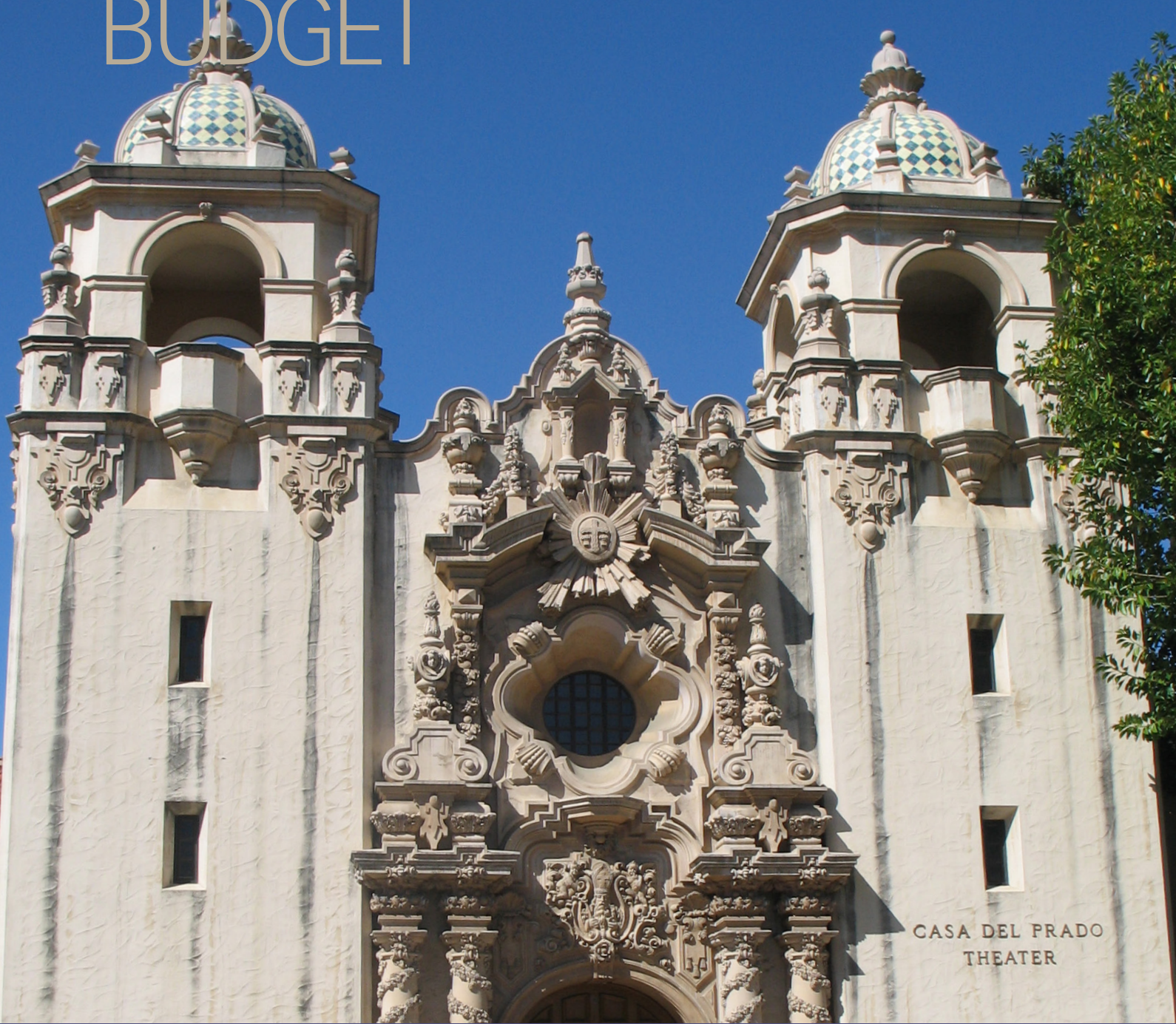
CASA DEL PRADO THEATER