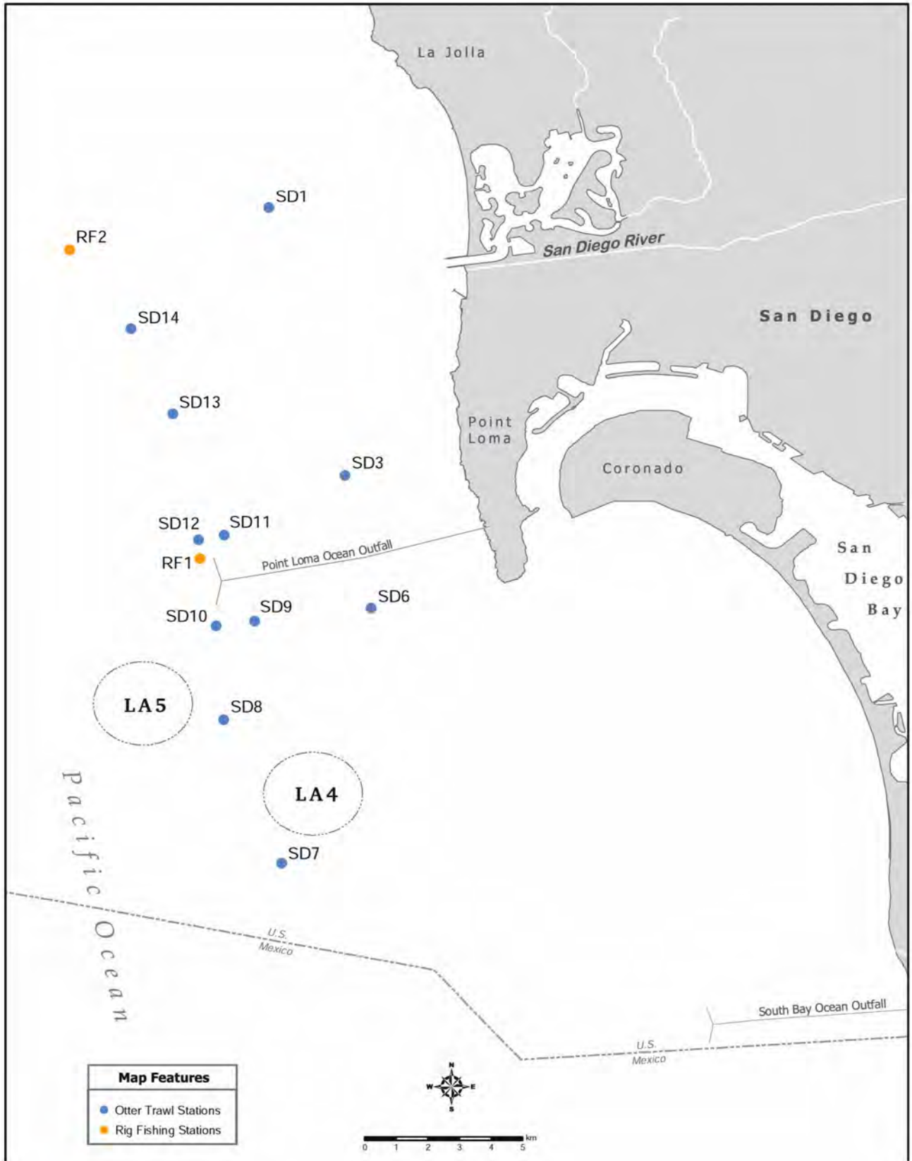
San Diego Rig Fishing and Trawl Stations