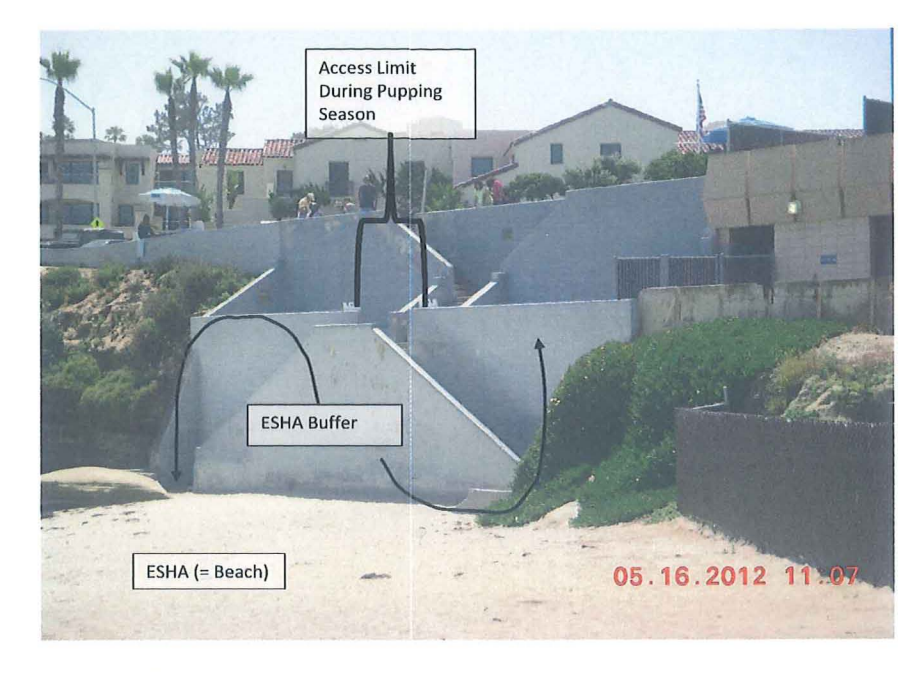
Proposed ESHA, buffer, and access limits