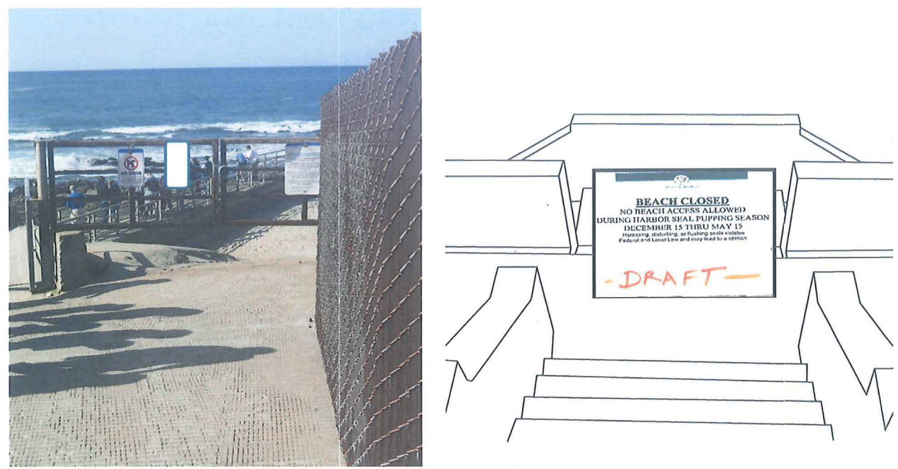
Proposed Signage: 24" wide by 18" tall on gate and 36" wide by 30" tall at top of lower stairs