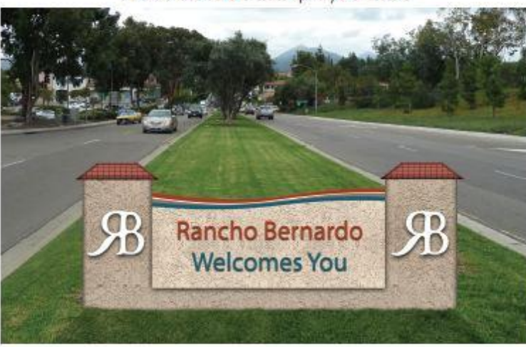
Entrance signage during evening hours with soft back lighting on RB logo and letters

Entrance signage during daylight hours a blend of traditional & contemporary architecture