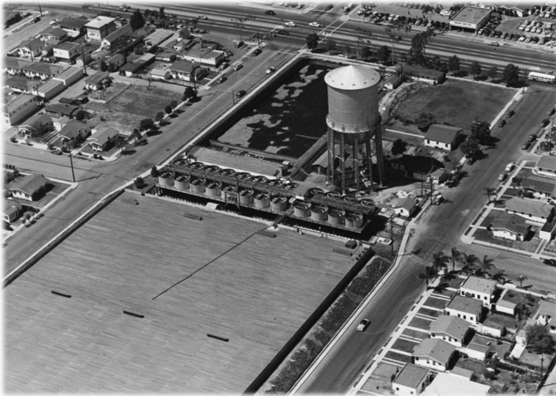
District: 1951 vs Present Day