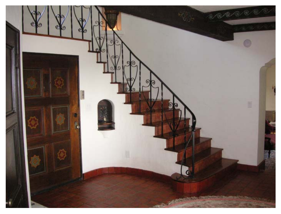
Photo 1: Original stairway and main entry lobby with Requa-style expression reflected in doors, historic tile work, and railings.

*Resource Name or # (Assigned by recorder) 2335 Juan Street