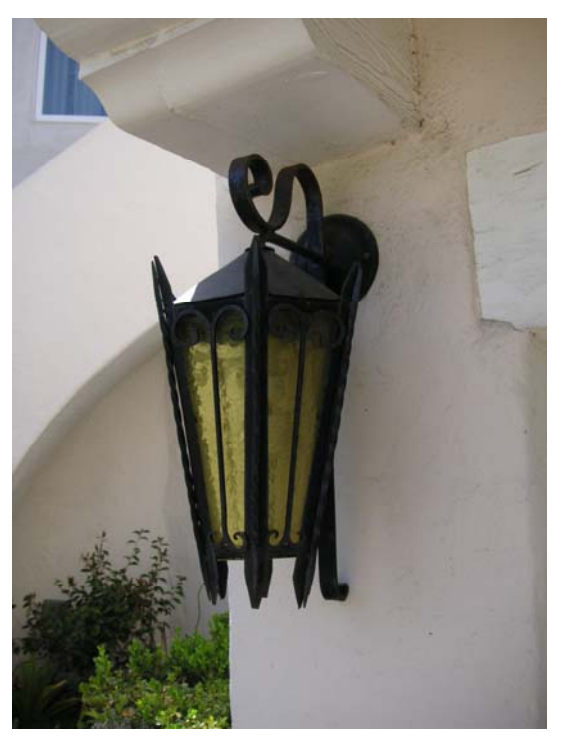
Photo 15: Corbel and original electric lamp on southwest elevation of garage.

*Resource Name or # (Assigned by recorder) 2335 Juan Street