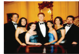
SAN DIEGO OPERA ENSEMBLE

IN CELEBRATION OF HISPANIC HERITAGE MONTH