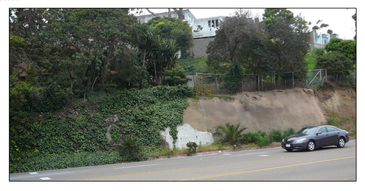
Picture 3943 - Station 19+00 South Slope with Existing Gunite Retaining Wall

A 300-foot long retaining wall on the south side of the road will be required from approximately <u>Station 17+80 to 20+80</u> (See Cross Section 3 of the project plans). The proposed wall would be required to be just outside the right of way in private property to provide a sidewalk width of 9 feet, although the sidewalk will be within the current right-of-way (ROW). At approximate Station 20+00 a house on the bluff above may impact the retaining wall design, see Pictures 3943 and 3942 below. The 9-foot sidewalk plus landscape width may need to be reduced to 5 feet to fit the wall in the ROW in this location.