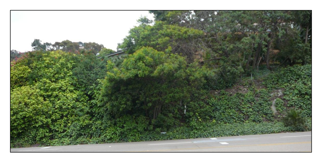
Picture 3942 - Station 20+00 South Slope Home located behind Dense Tree