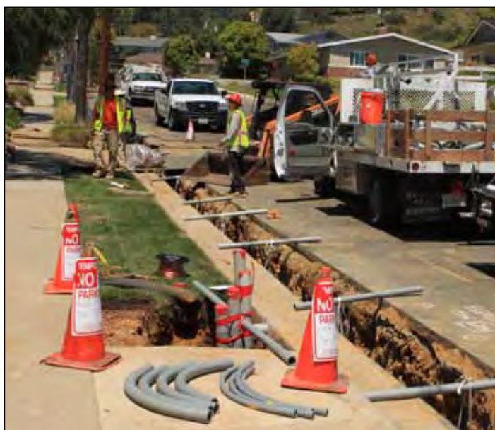
Trench work on the 5600 block of Meredith Avenue.

You have likely seen trenching crews working in the streets. Trench work is approximately 65% complete in Project Block 7CC. We ask for your patience as they complete this work, as it can be disruptive and distracting. Approximately two weeks prior to the start of the trench work on your property and in the street, you will receive a door hanger with the trenching contractor's name and phone number on it. If you have any questions or concerns about the work, please do not hesitate to contact the contractor.