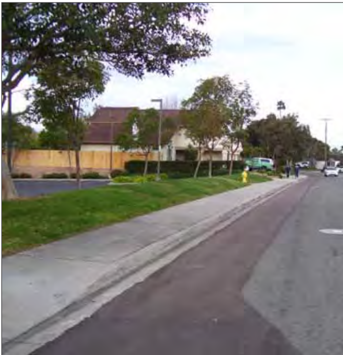
Newly completed trench work and sidewalk.

SDG&E is 100% complete with cabling activities.