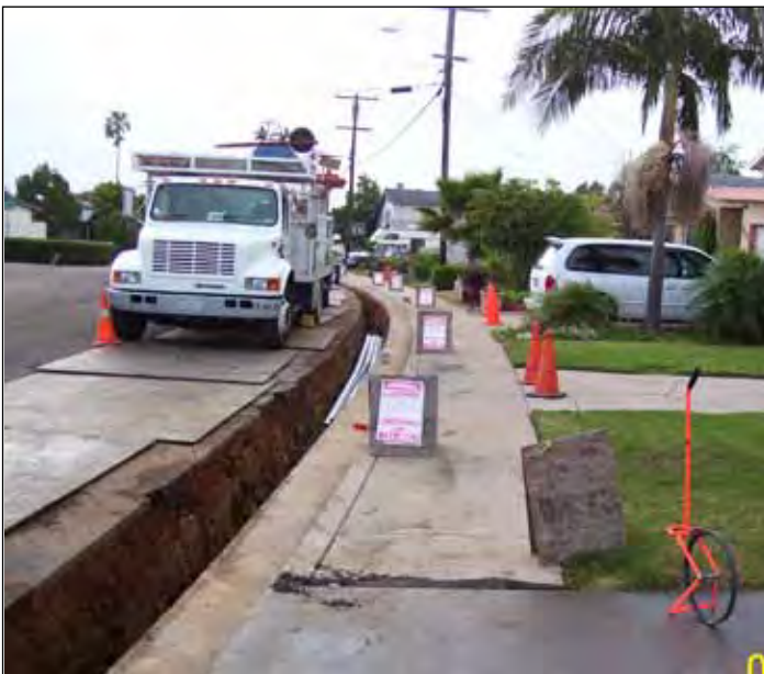
Trenching activities continue to progress along 20th and 21st Street.

You have likely seen trenching crews working in the streets. Trench work is approximately 50% complete in Project Block 8G. We ask for your patience as they complete this work, as it can be disruptive and distracting. Approximately two weeks prior to the start of the trench work on your property and in the street, you will receive a door hanger with the trenching contractor's name and phone number on it. If you have any questions or concerns about the work, please do not hesitate to contact the contractor.