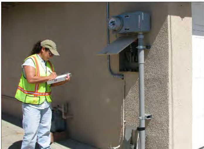
City inspector evaluates a customer's newly installed meter adaptor that connects the meter with the underground utilities.

AT&T is 75% complete with cabling, 30% complete with customer cut-overs and 30% complete with overhead line removal activities.